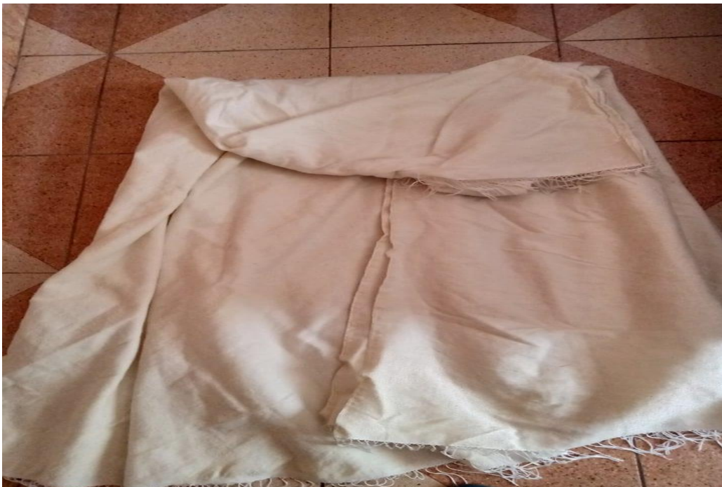
Tugna 37 « Abernus» 47