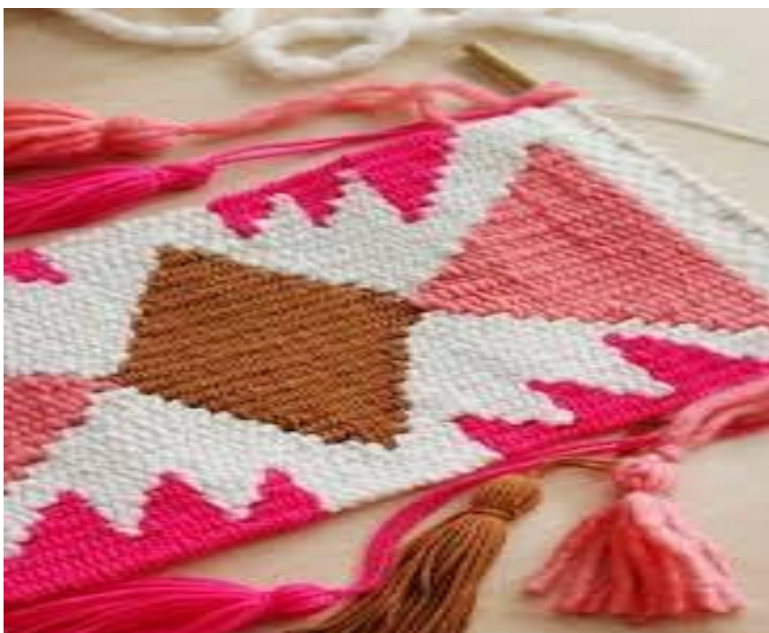
Tugna 55 «Lyarza»