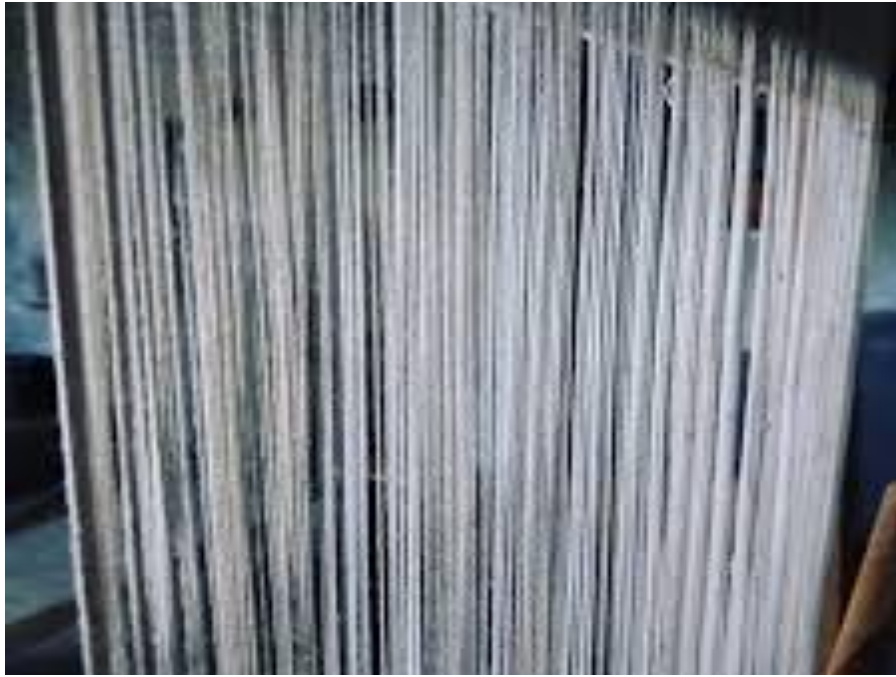
Tugna 29 «Ustu» 42