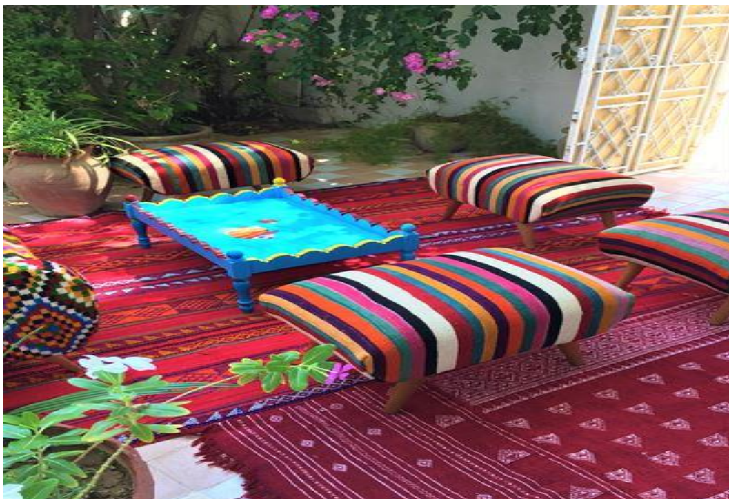
Tugna 35 « Tisumtiwin»