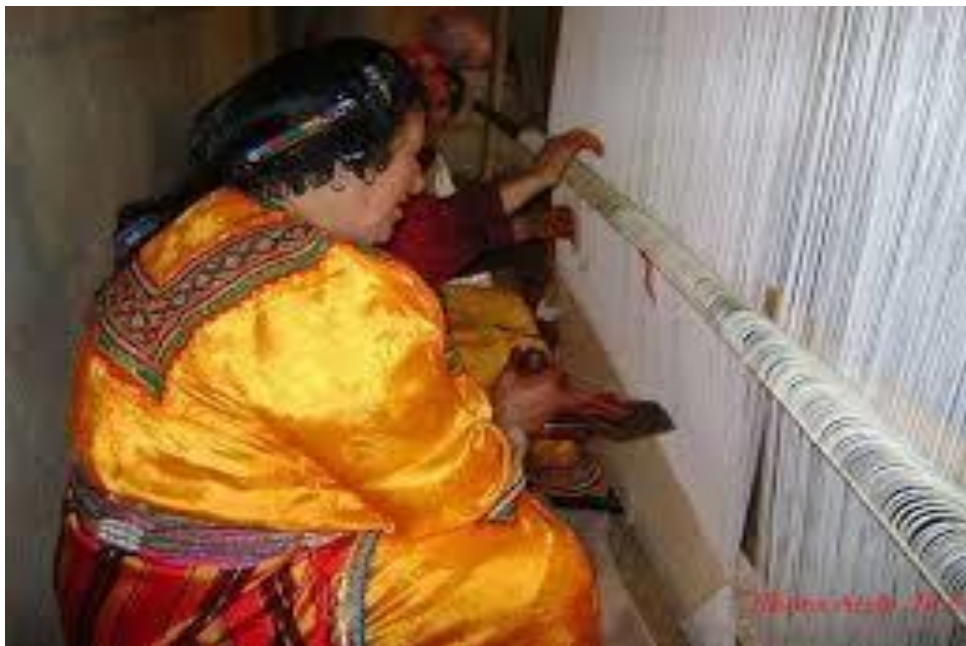
Tugna 23 «Tara n yilni» 38