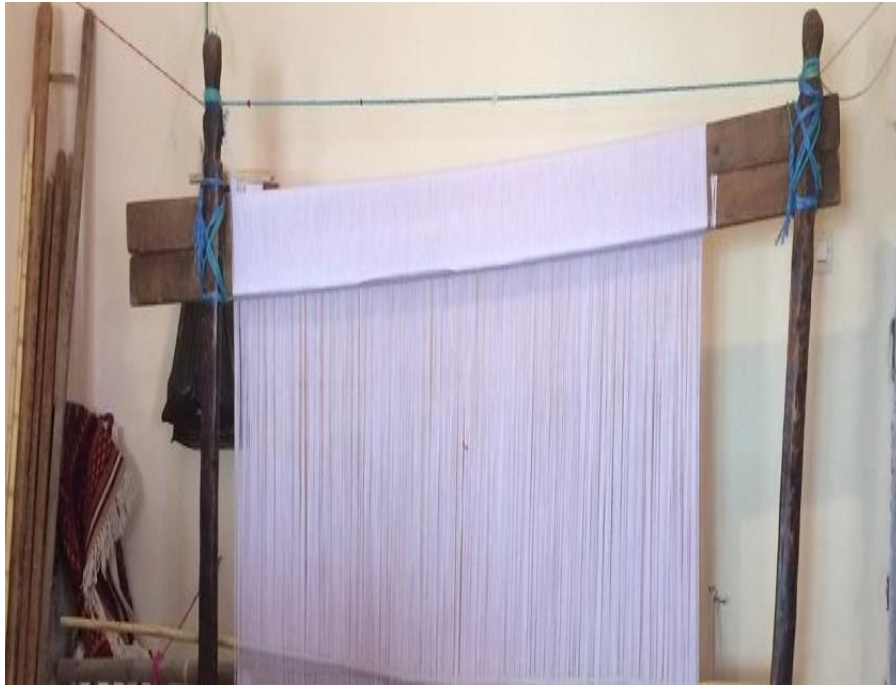
Tugna 27 « Afeggag n ufella»