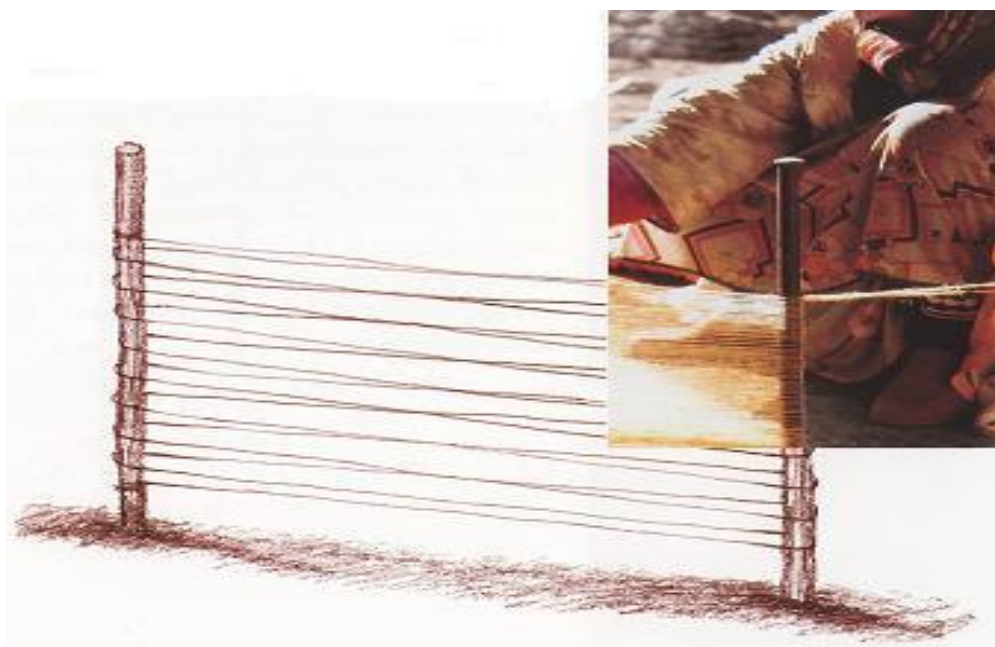
Tugna 18 « Iggagen»