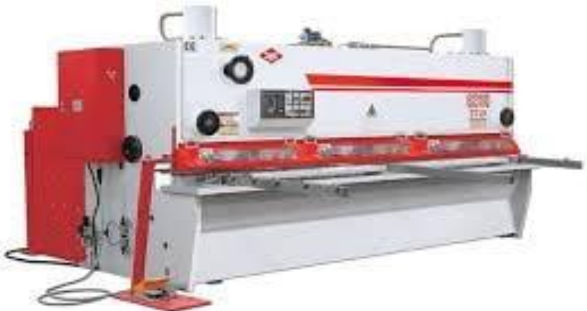
Tugna 49 « Allal n uzetđa »