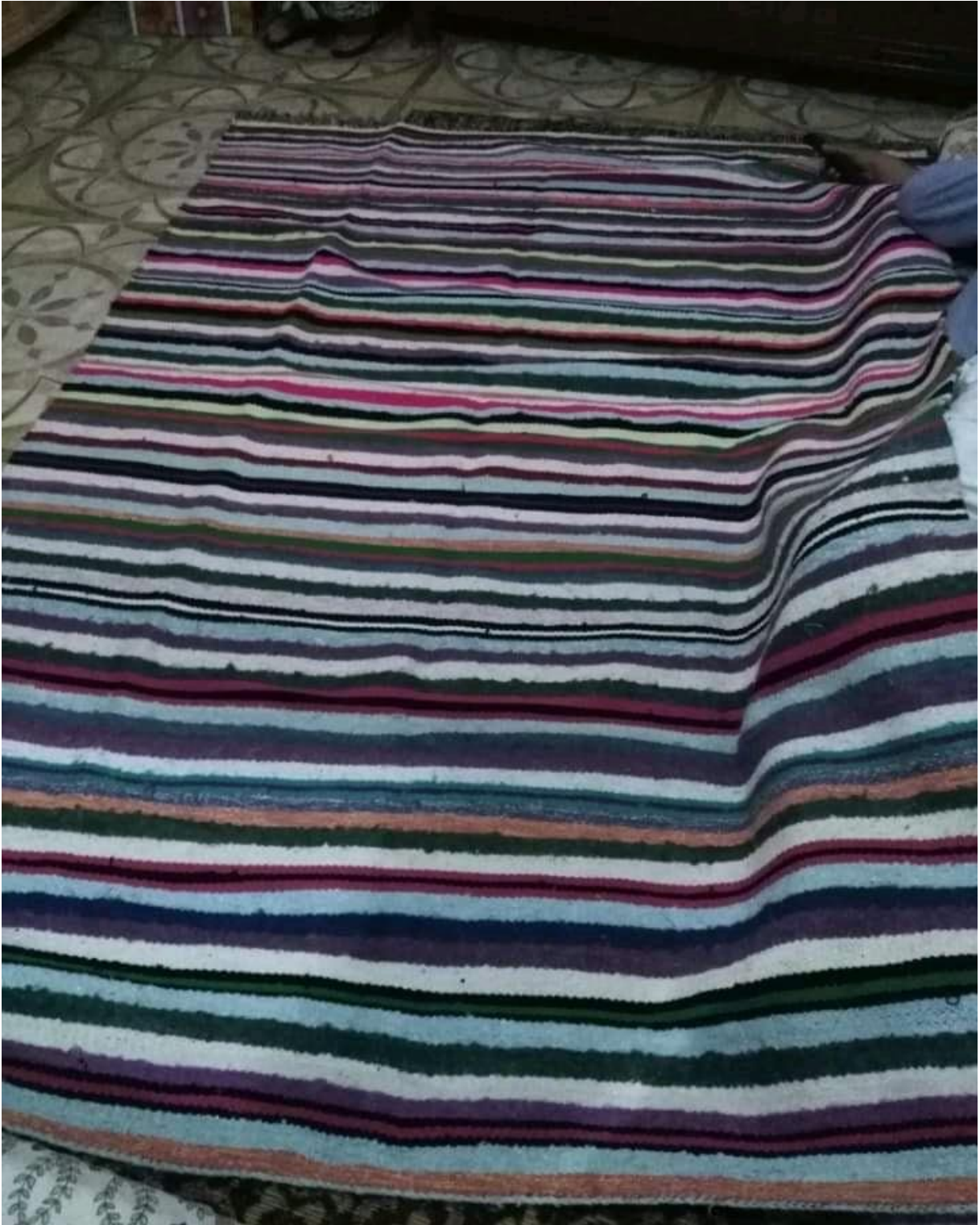
Tugna 33 « taxellalt» 46