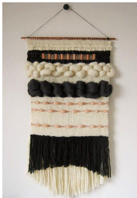
Tugna 56 «Iællaqen»