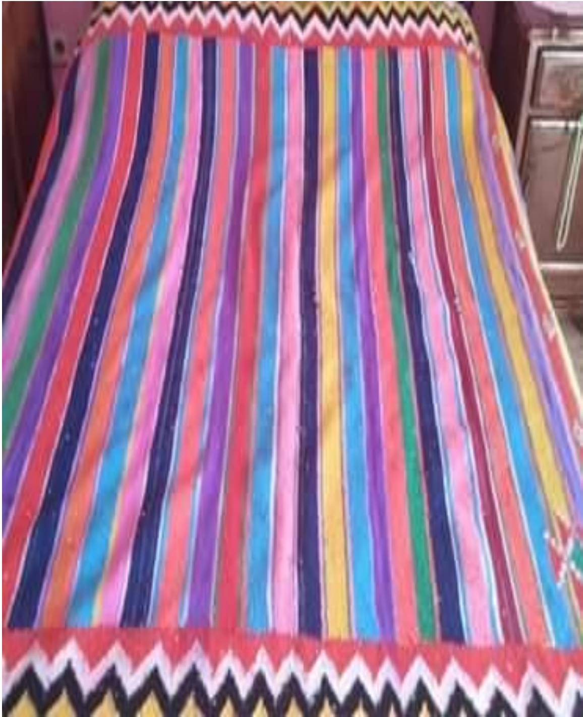
Tugna 47 « Taxellalt» 57