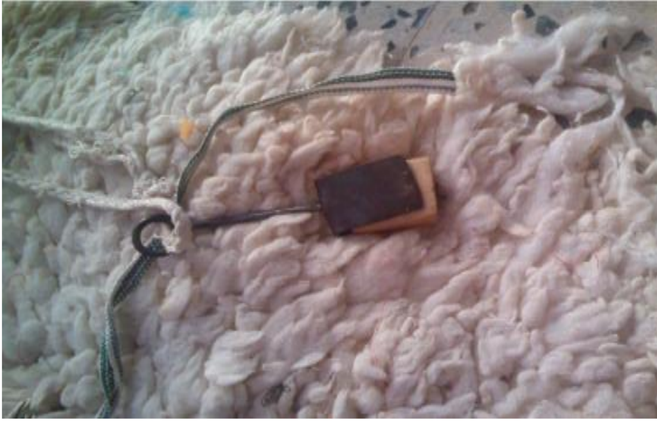
Tugna 21 «Tijebbadin» 37