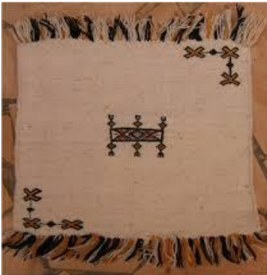
Tugna 54 «Tazerbit tameçtuht»