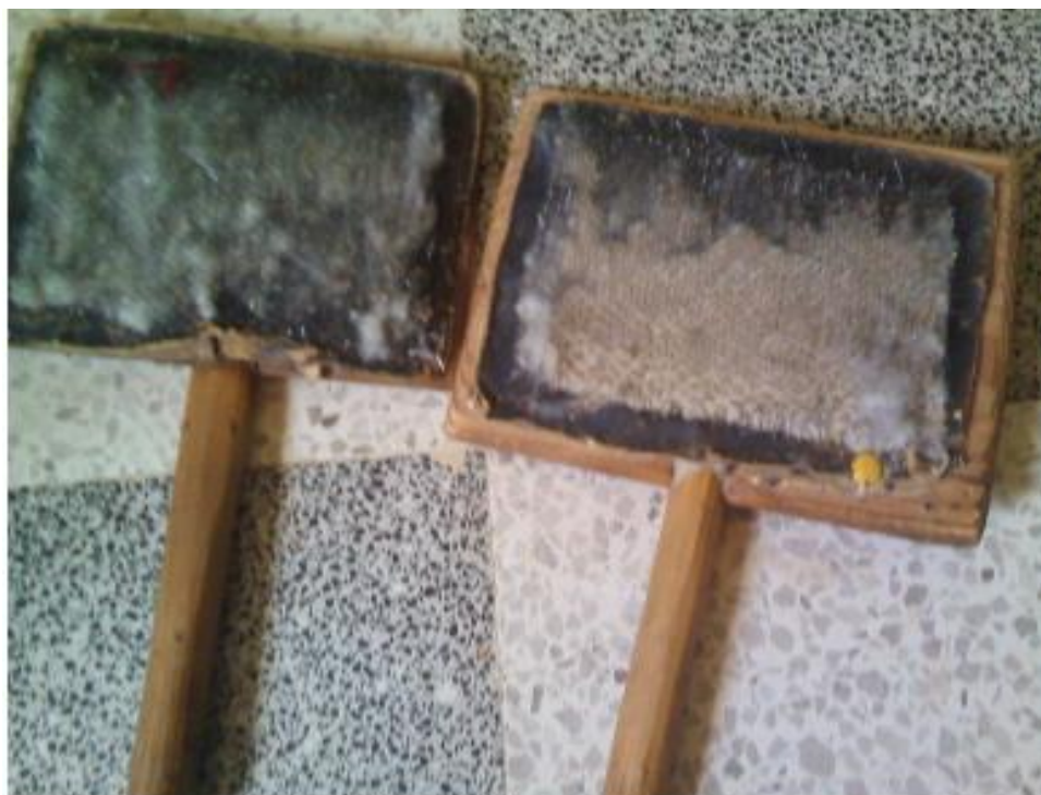
Tugna 20 « Aqerdac» 36