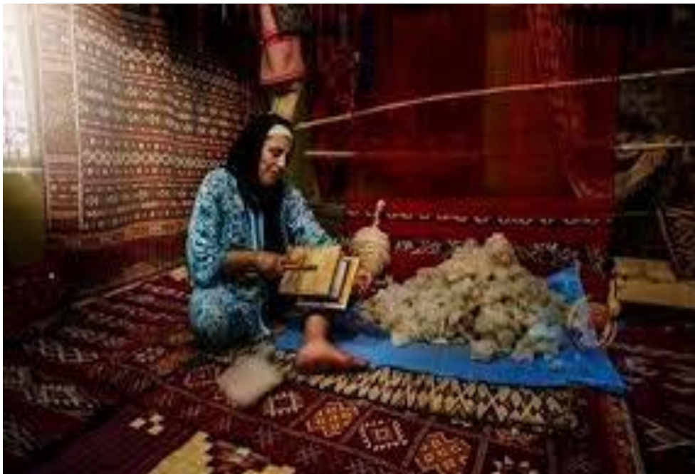
Tugna 06 « Asqardec n tađuţ»