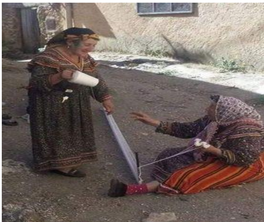
Tugna 10 « Azizel n uzetța »