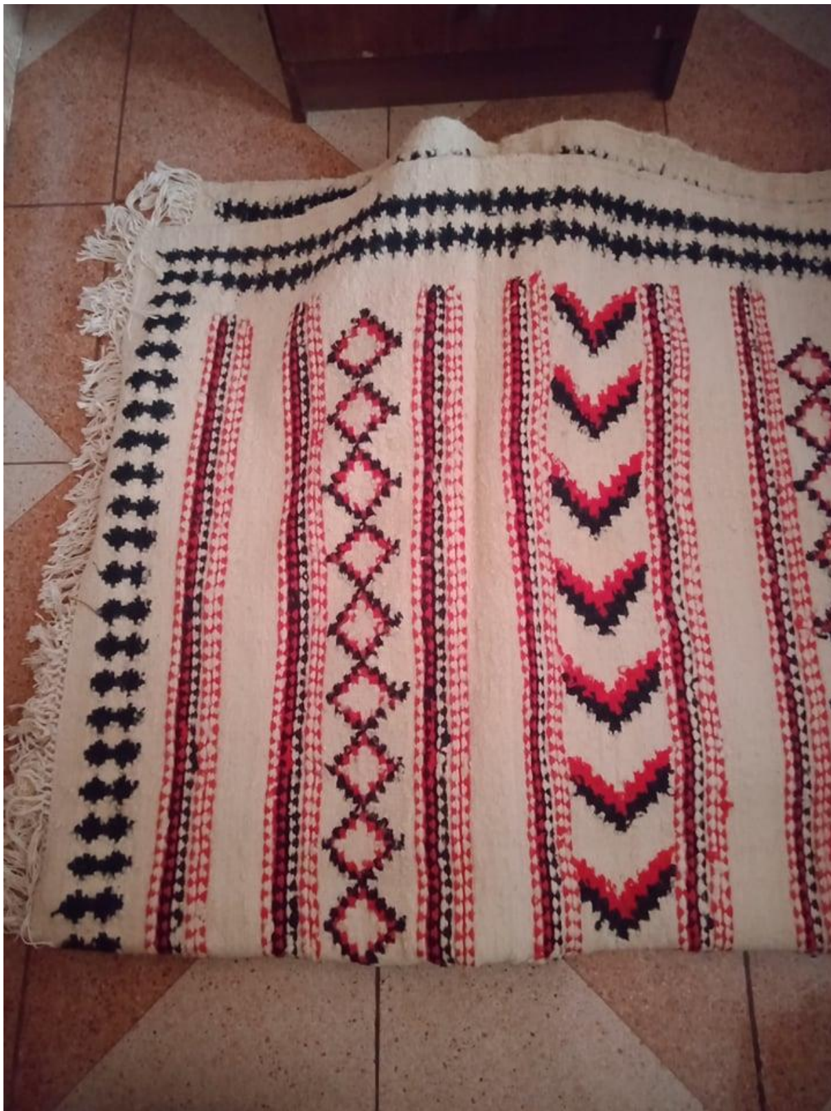
Tugna 40 «Tazerbit» 50