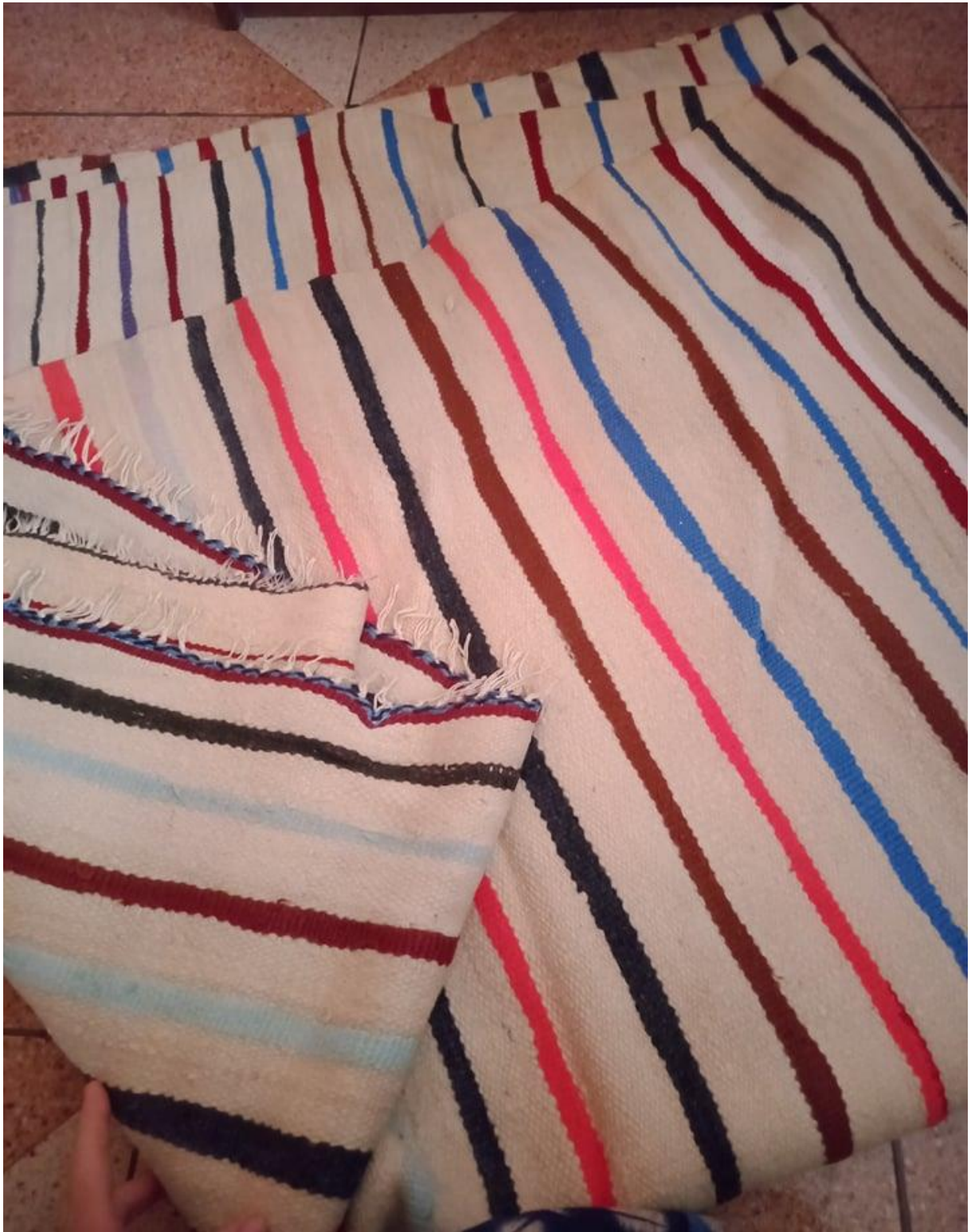
Tugna 42 «Taxellalt» 52