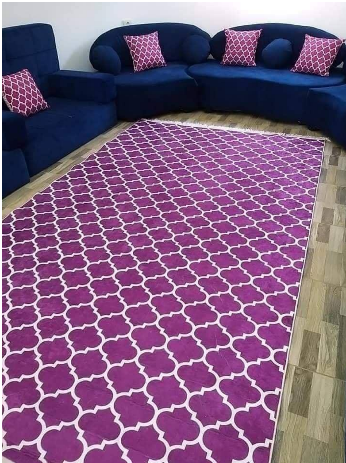
Tugna 52 «Tazerbit »