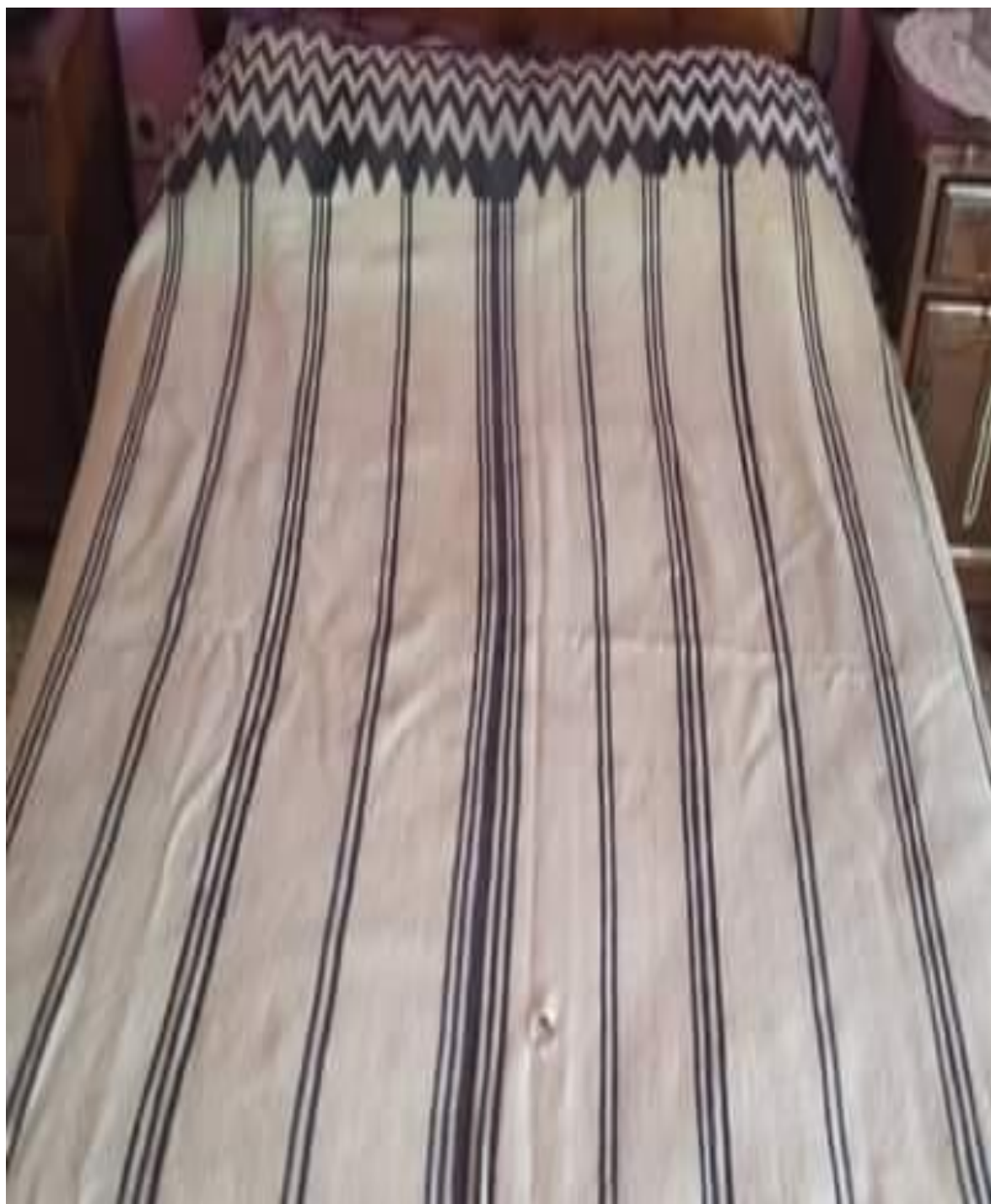
Tugna 45 «Taxellalt n yizarigen» 55