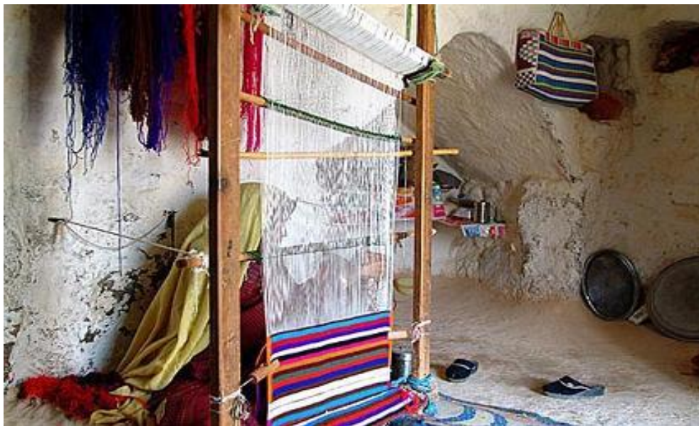
Tugna 30 «Tirigliwin» 43