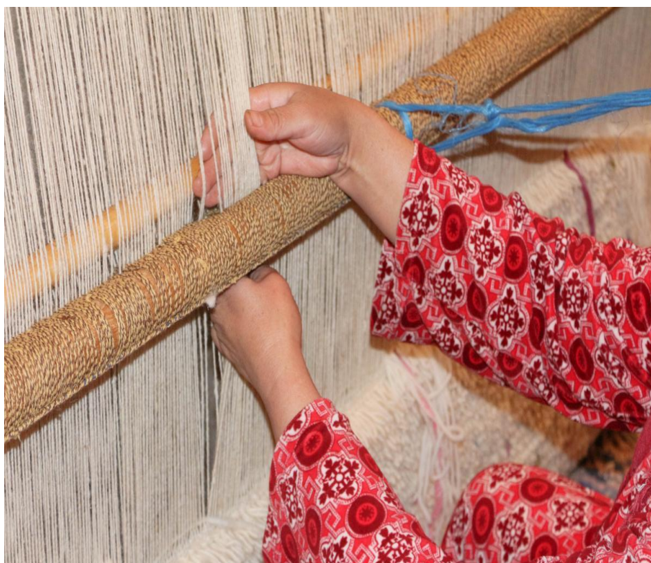
Tugna 24 «Ixiđ n yilni» 39