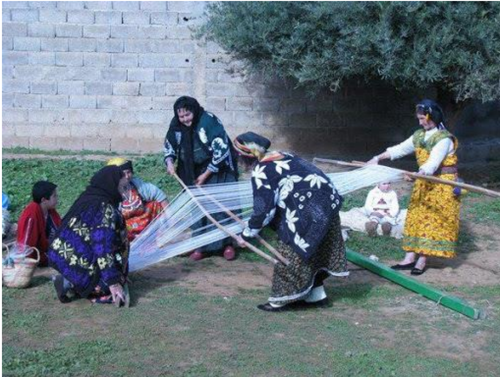
Tugna 11 « Ajbad n uzetţa » 31