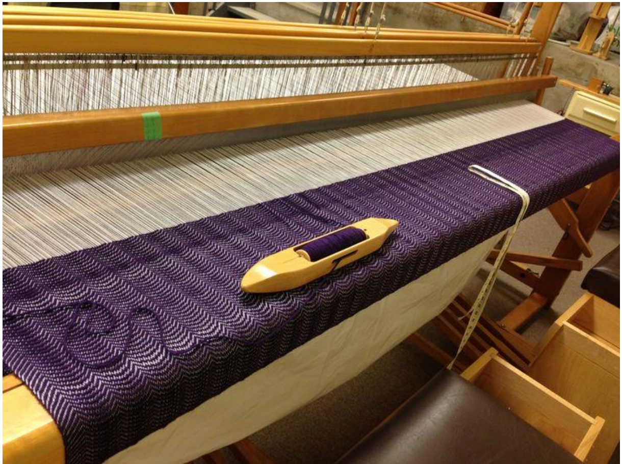
Tugna 50 «Ttawil n uzetđa»