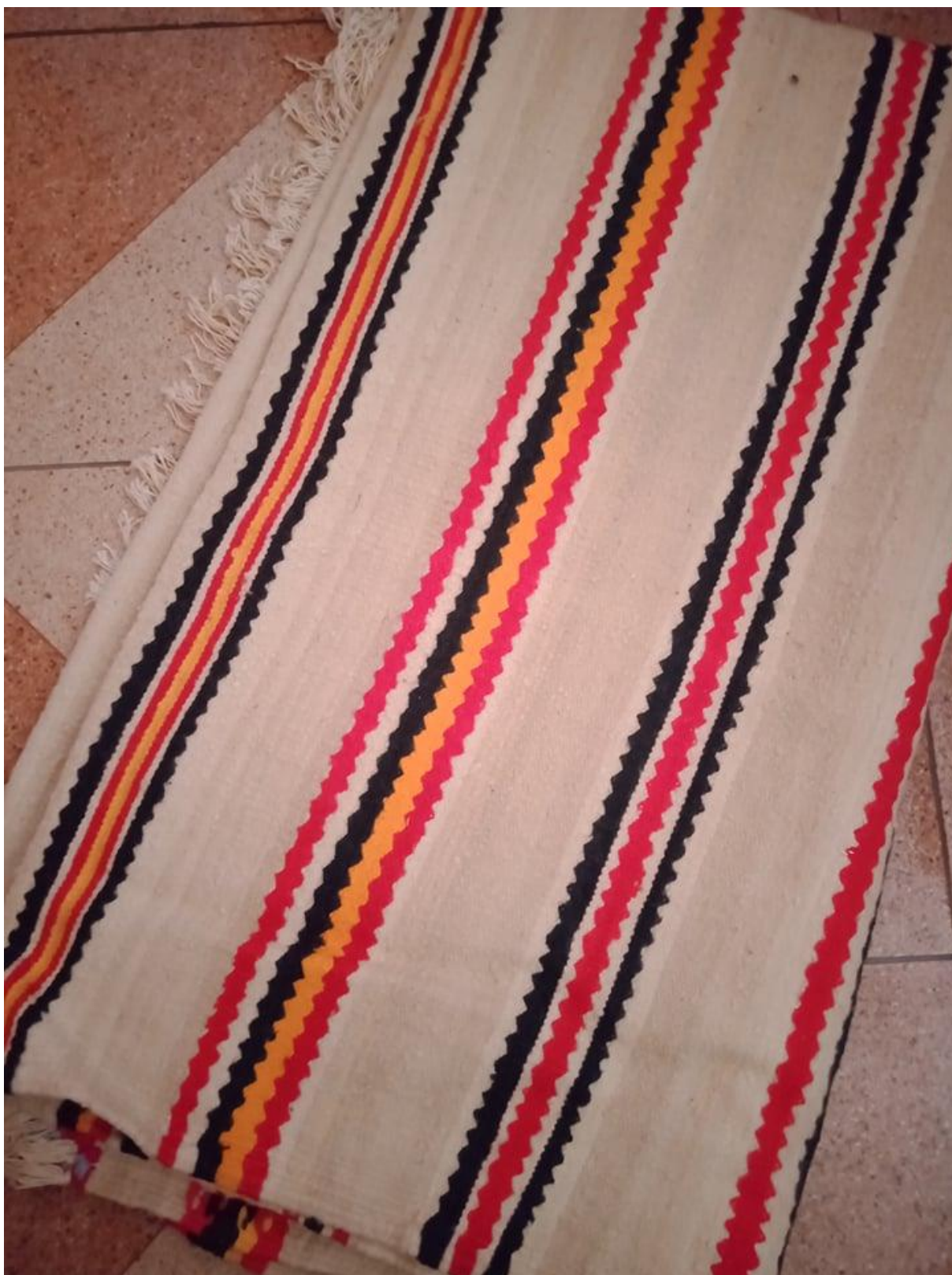
Tugna 49 «Tazerbit n buzarigen» 49