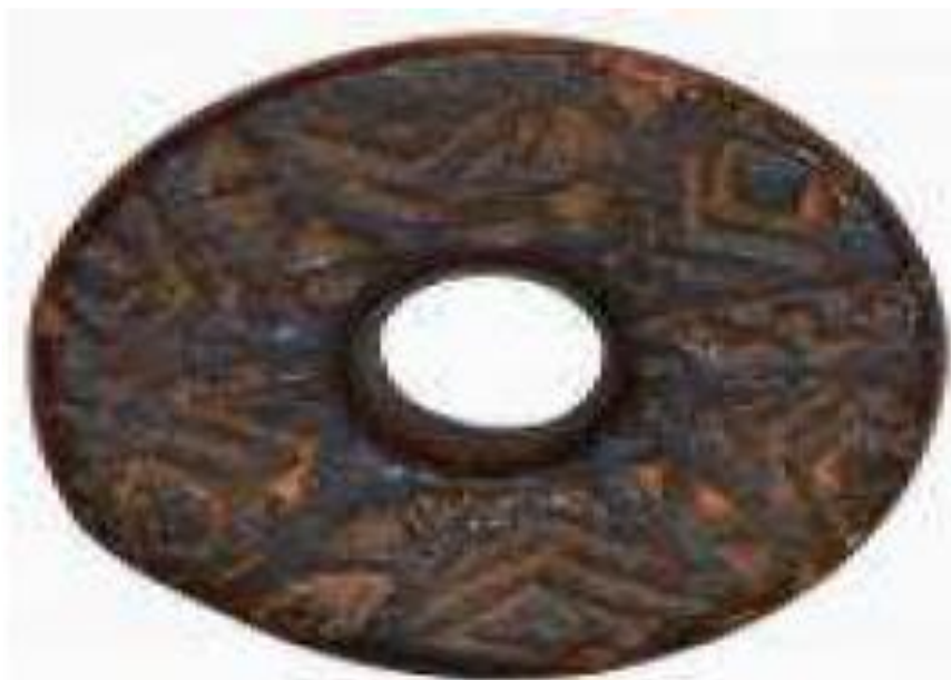
Tugna 26 « Aqecrir » 40