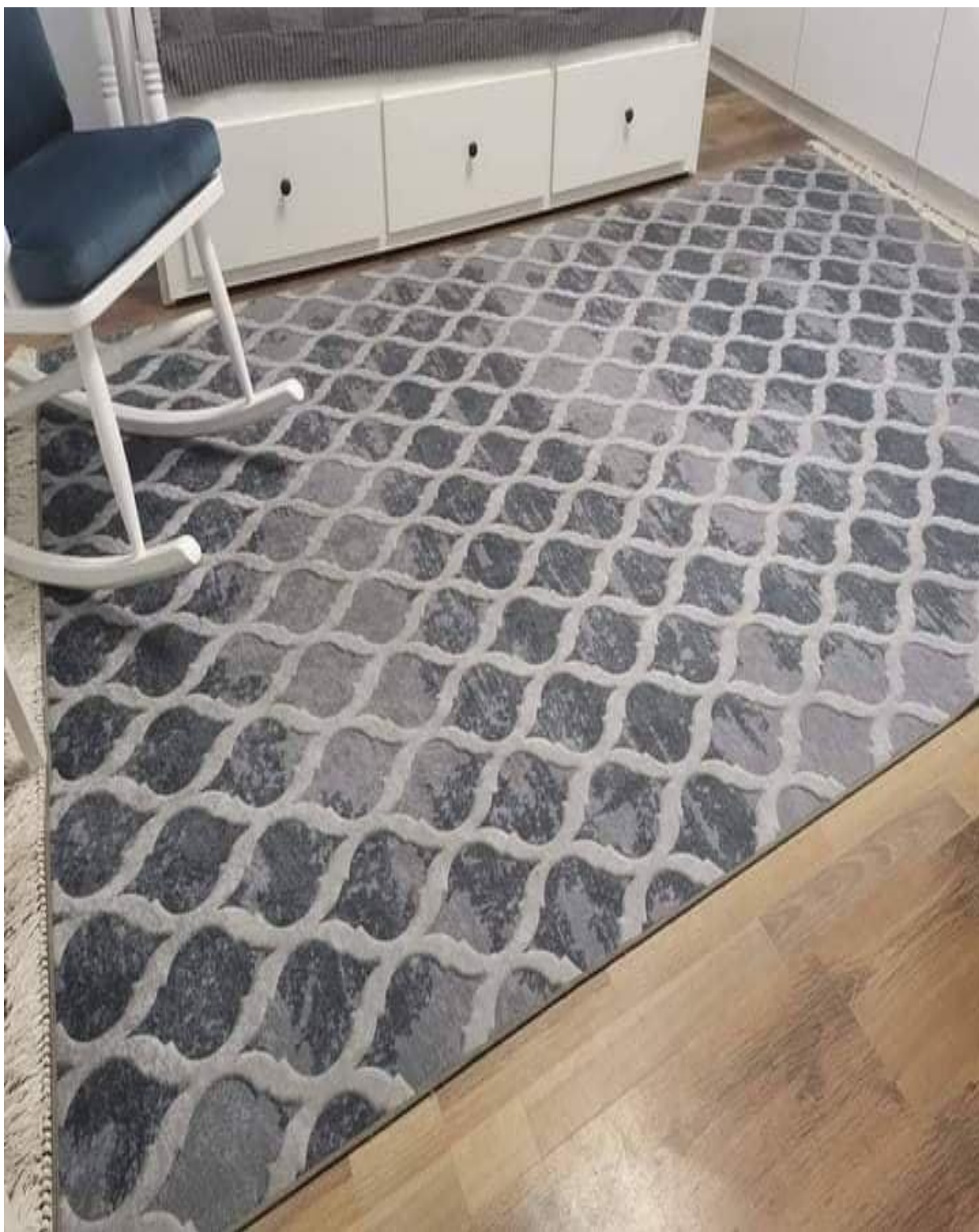
Tugna 53 «Tazerbit»