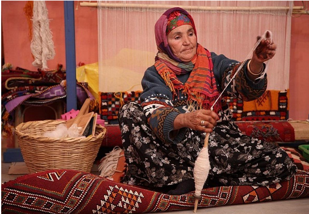
Tugna 07 « Izdi »