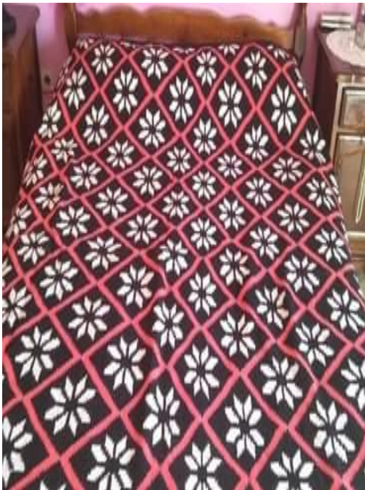
Tugna 44 «Taxellalt n arqem» 54