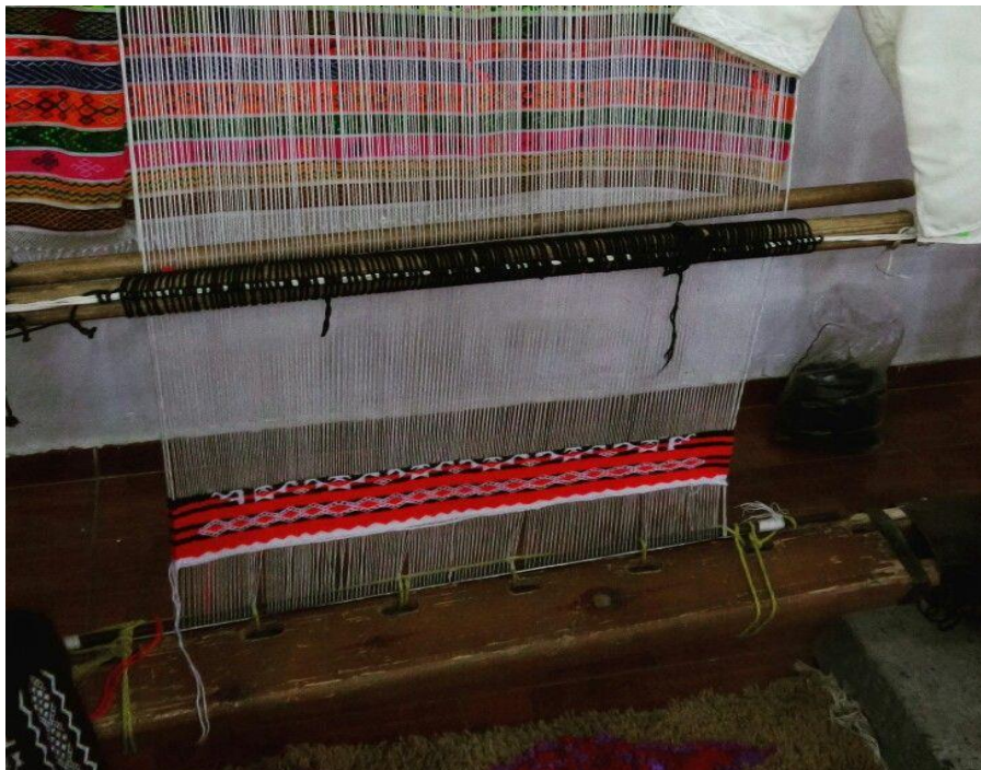
Tugna 28 « Afeggag n wada» 41