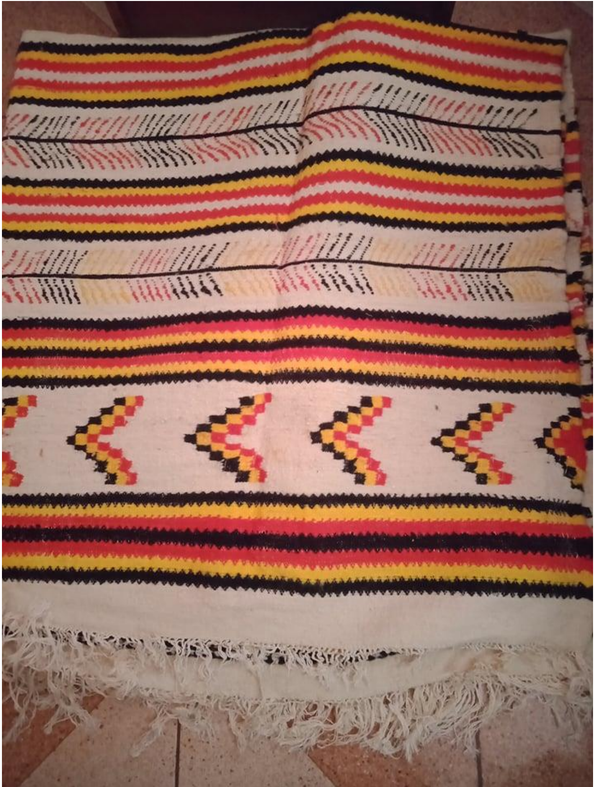
Tugna 38 «Tazerbit n yiyes n lħut» 48