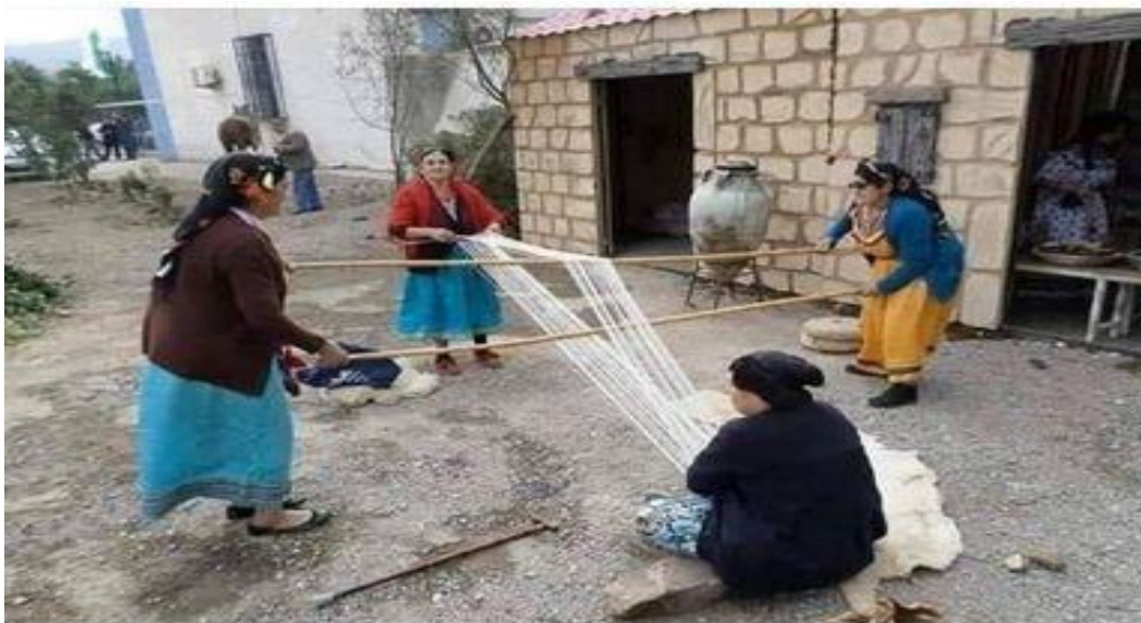
Tugna 12 « Ajbad n uzetţa » 32