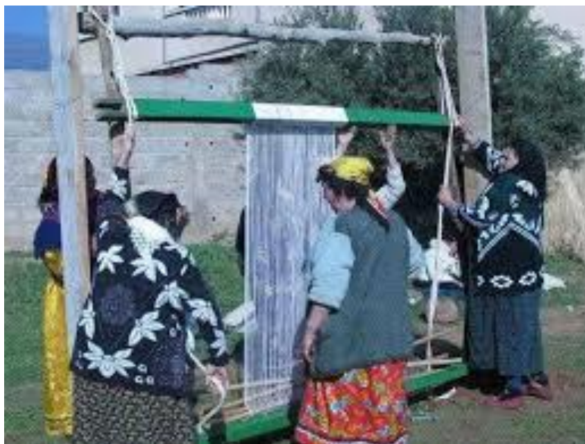
Tugna 13 « Asbedded n uzetţa» 33