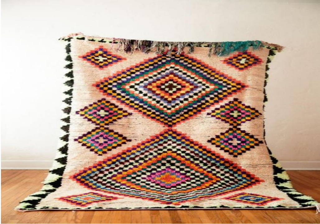
Tugna 36 « Tazerbit »