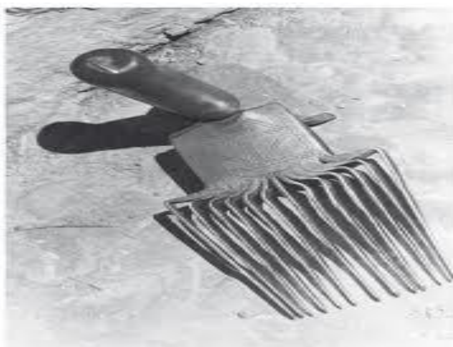
Tugna 16 « tayazilt »