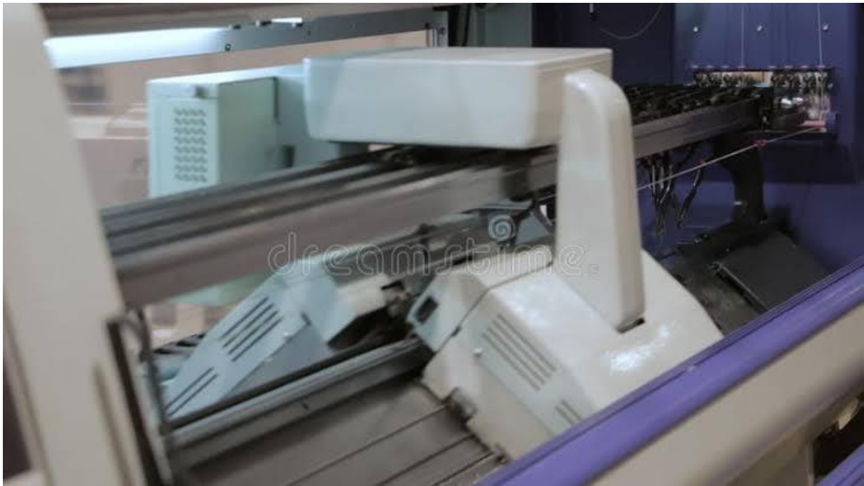
Tugna 48 « Allal n uzetđa »