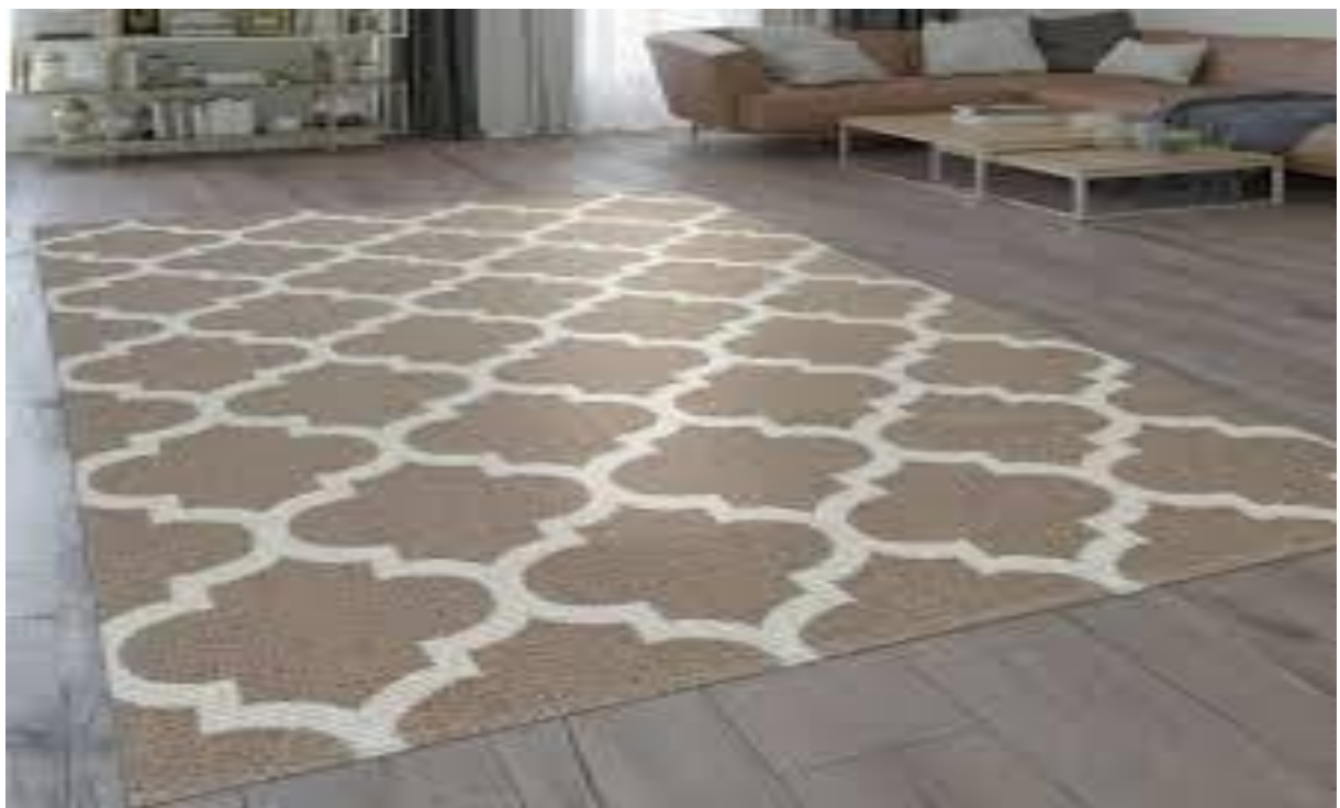
Tugna 51 «Tazerbit»