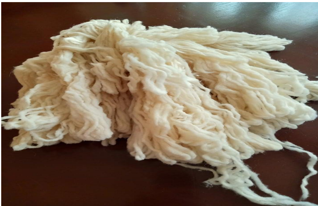
Tugna 08 «Ulman» 30