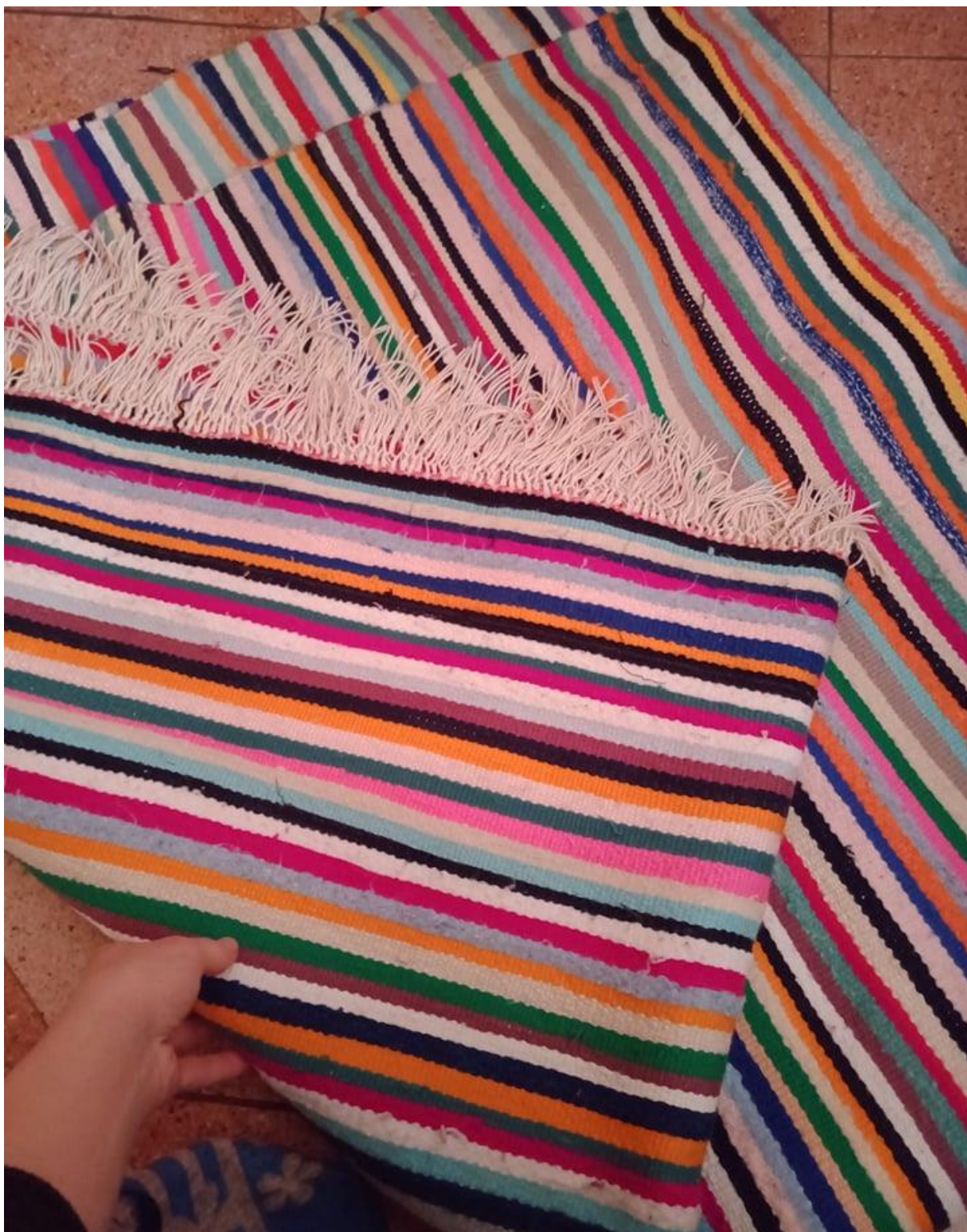
Tugna 43 «Taxellalt» 53