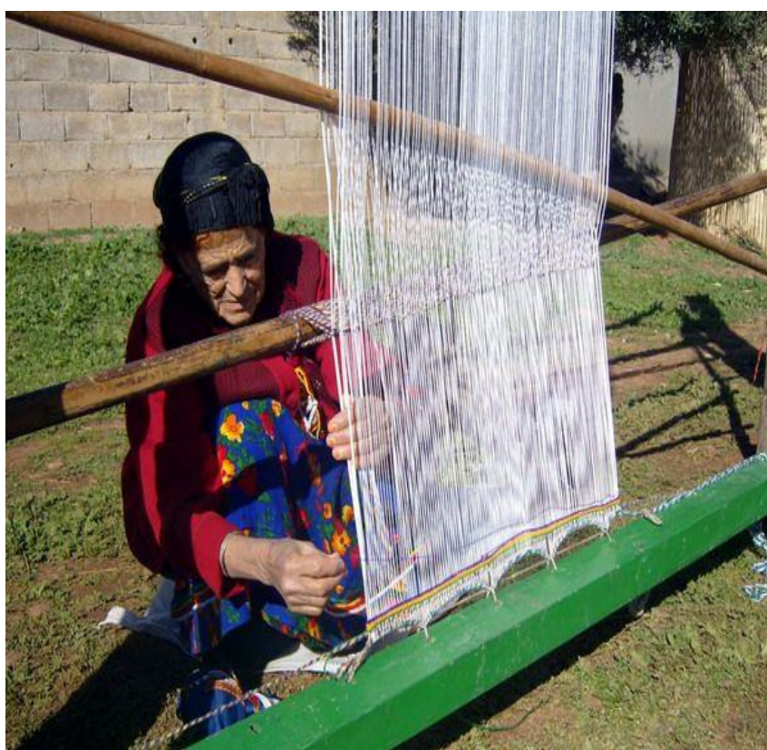
Tugna 14 « Beddu n uzetţa» 34