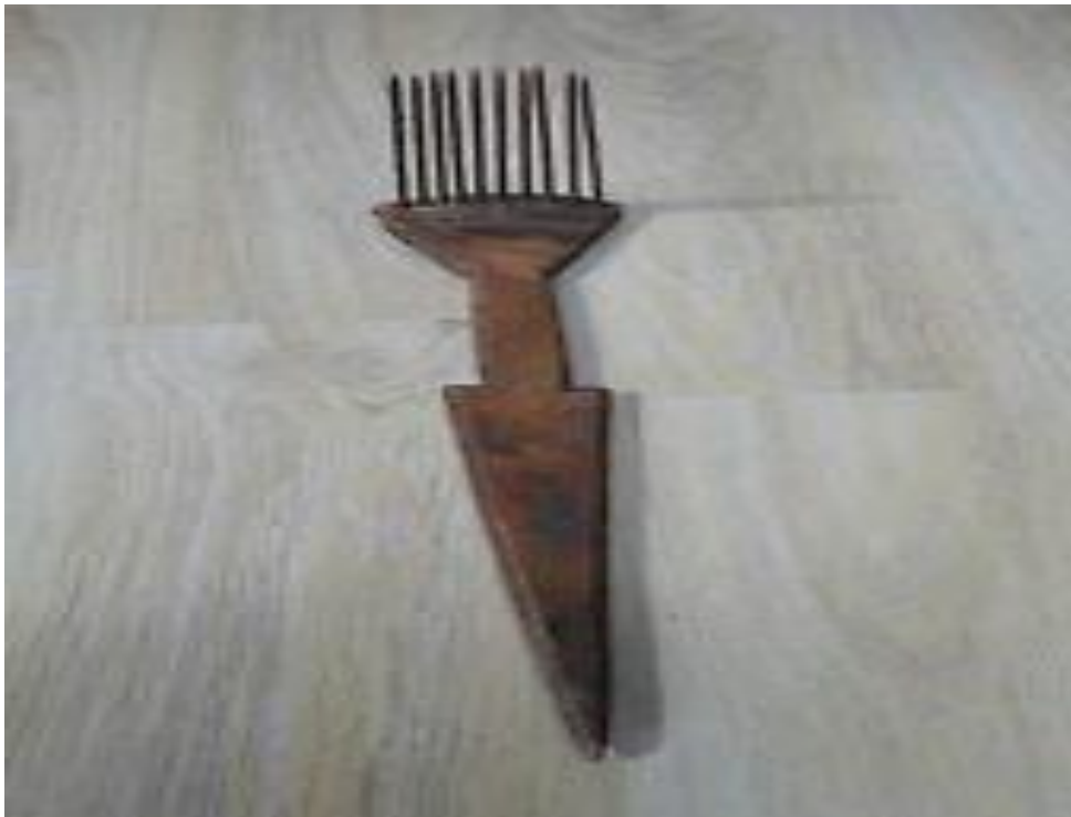
Tugna 22 « Imceç»