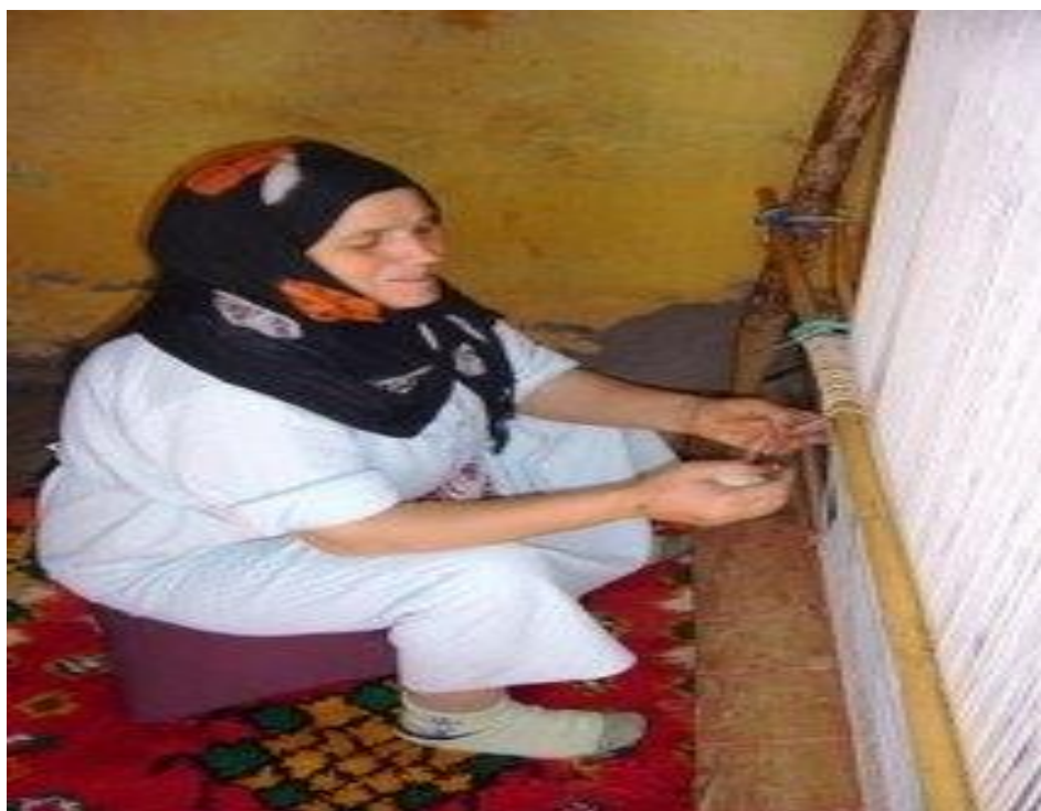
Tugna 25 « Ixiđ n yilni »