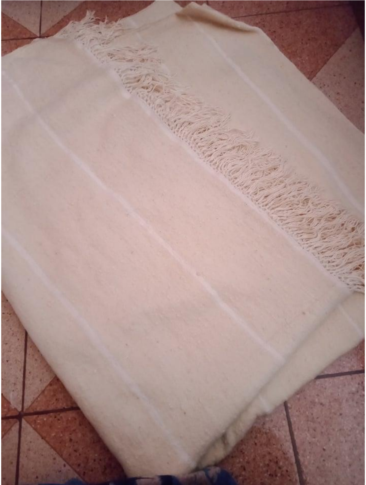
Tugna 41 « Axellal» 51