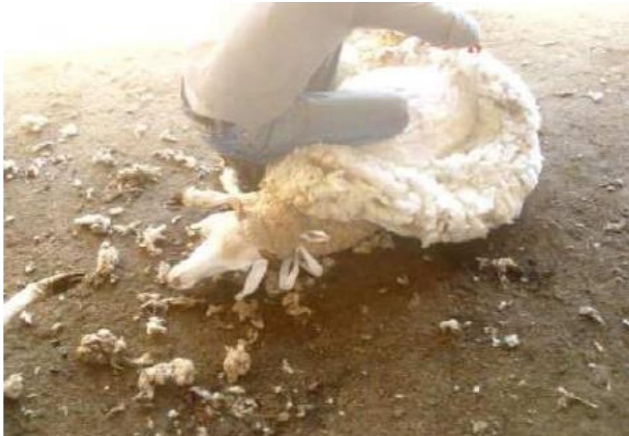
Tugna 03 «Talsa n lmal»

Mi ara teffay cetwa ad kecmen izegzawen, ad yekcem lhamu ad yaweđ lawan n Tulsa, ttawin ulli d wakraren yer tmizar i waken ad t-nelsen s lemques talsa, yal yiwen s nnuba-s srusen-ten deg lqaea, acku ma ara ad ten-telsen akken qaren-as « lles, lles yer qabel ad amnelles» 6 , iwakken ad as-nteksen lxuf, Tulsa agi n lmal d cyel n yergazen