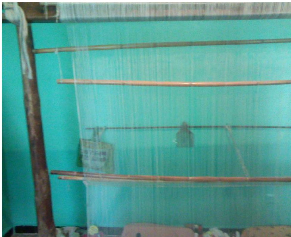
Tugna 17 «iyunam»