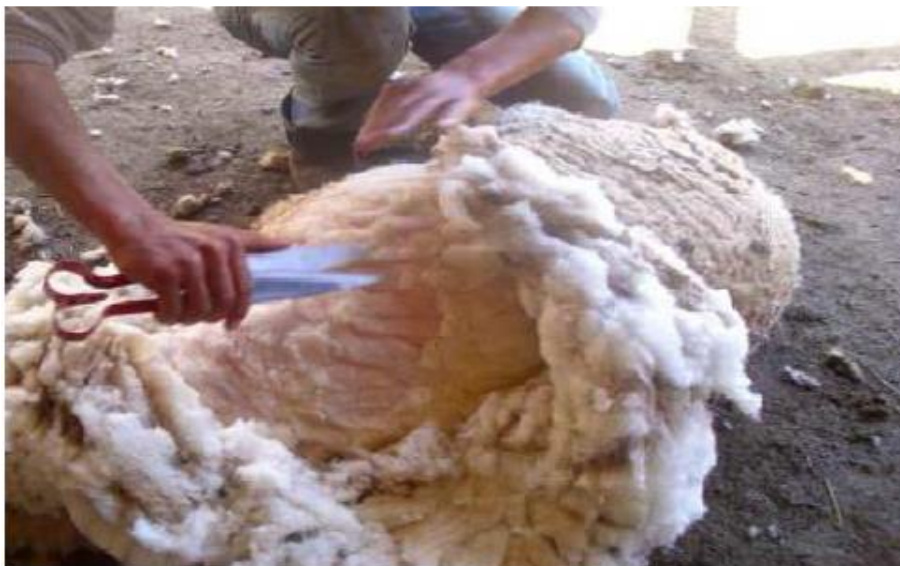
Tugna 04 «Tulsa n lmal» 7

Buğlil seg zik d tin i twasnen s lħirfat,d wagi i d-axeddim-nsen, Buğlil tesea tiyiwanin-nniđen i tyettabaesen am Aydasem, At ħlasa, Tawrirt muħend u musa, At seida, Tlefsa, yal tamnađt deg tigi tesea lħerfat-is am Aydasen akken i deħkan fell-as tettwasen seg zik s syaya, d nettat i yxedmen ayen tettēaliq tmettut ama d lfeta ney d nħas, ma nruħ yer tansawt id yezgan yef usawen seg zik tettwasen s lħirfa n ijelden* , llan zik d nutni i xedmen iħezdamen, isebbaden akked lkabat, nutni ttwasnen s wayen yerzan ak anecta.