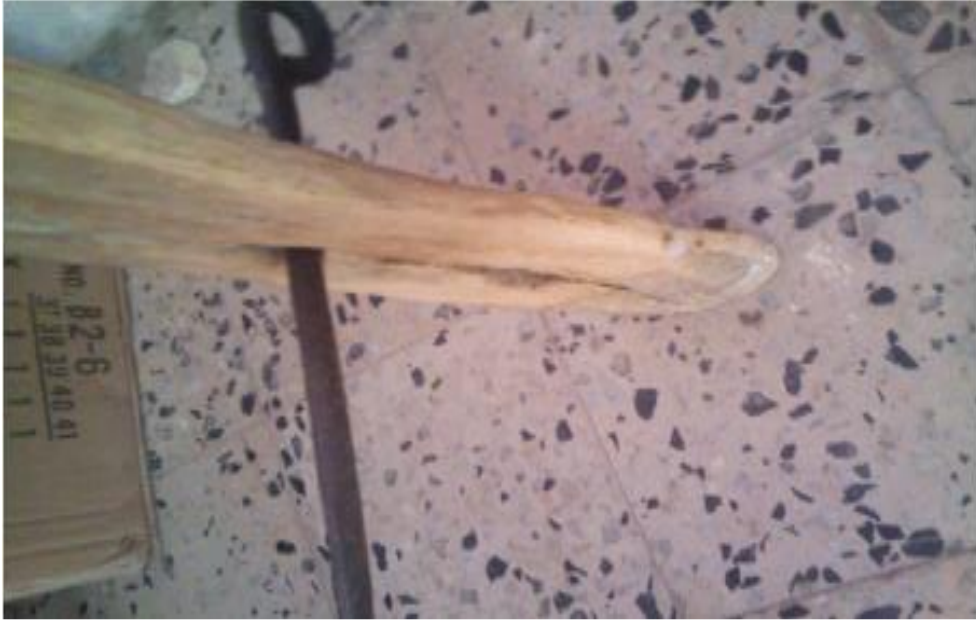
Tugna 31 « Tasegrut» 44