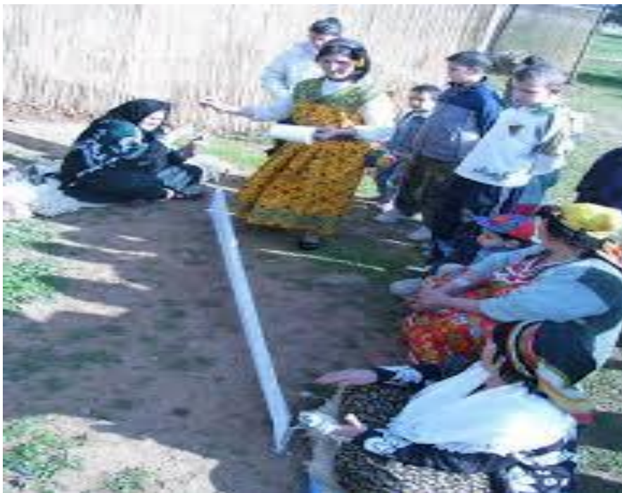
Tugna 09 « Azizel n uzetța »