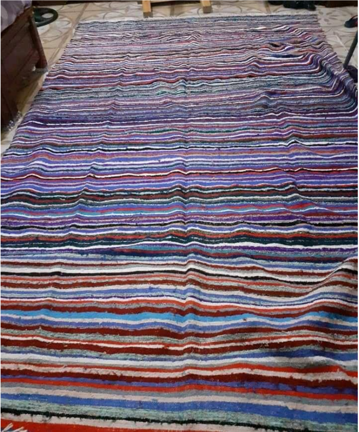
Tugna 32 « Taxellalt» 45