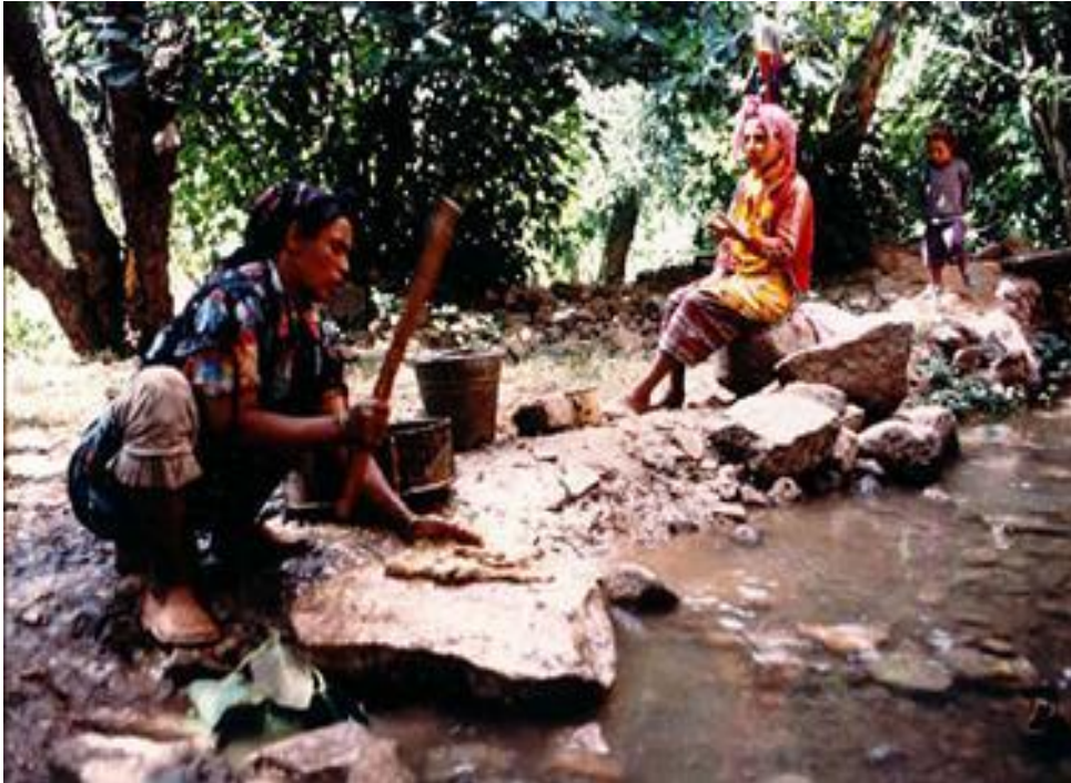
Tugna 05 «Tarda n tađuţ»