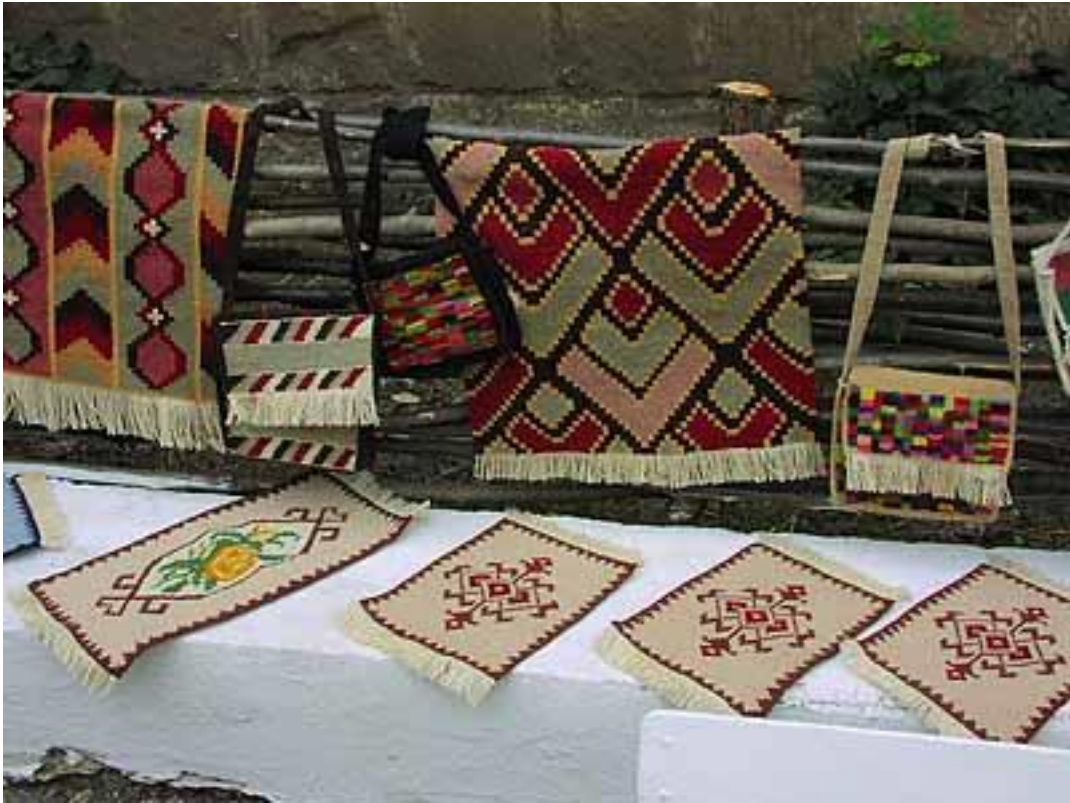
Tugna 60 «Tazerbit tamectuht»