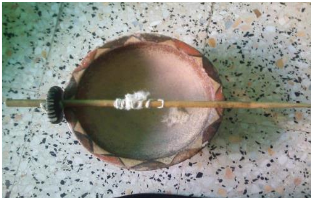
Tugna 19 « Izdi» 35