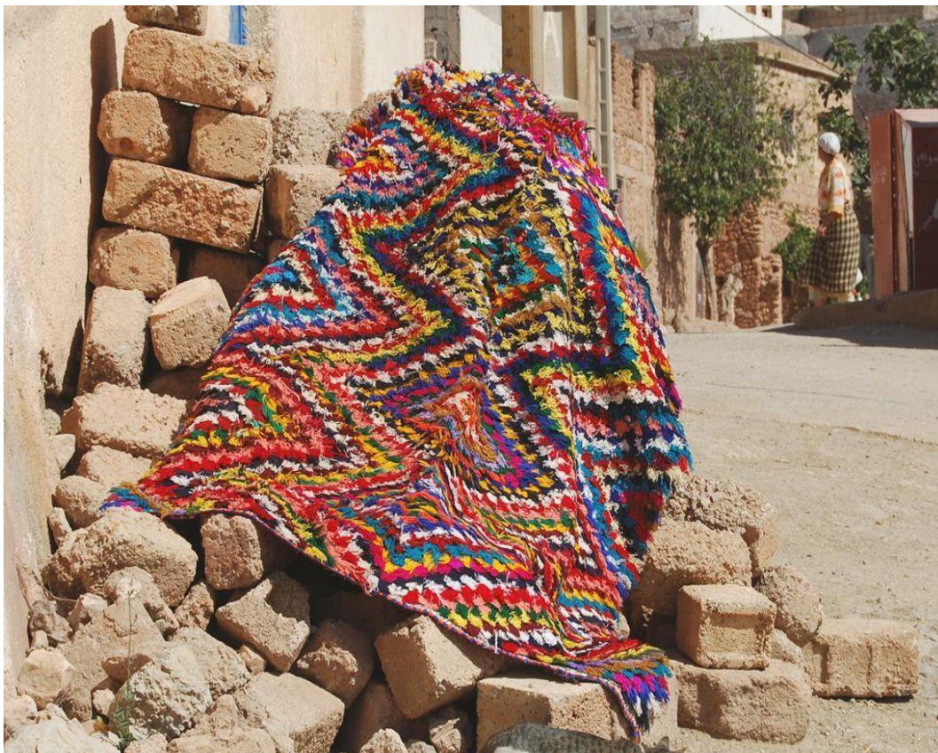
Tugna 34 « Tazerbit»