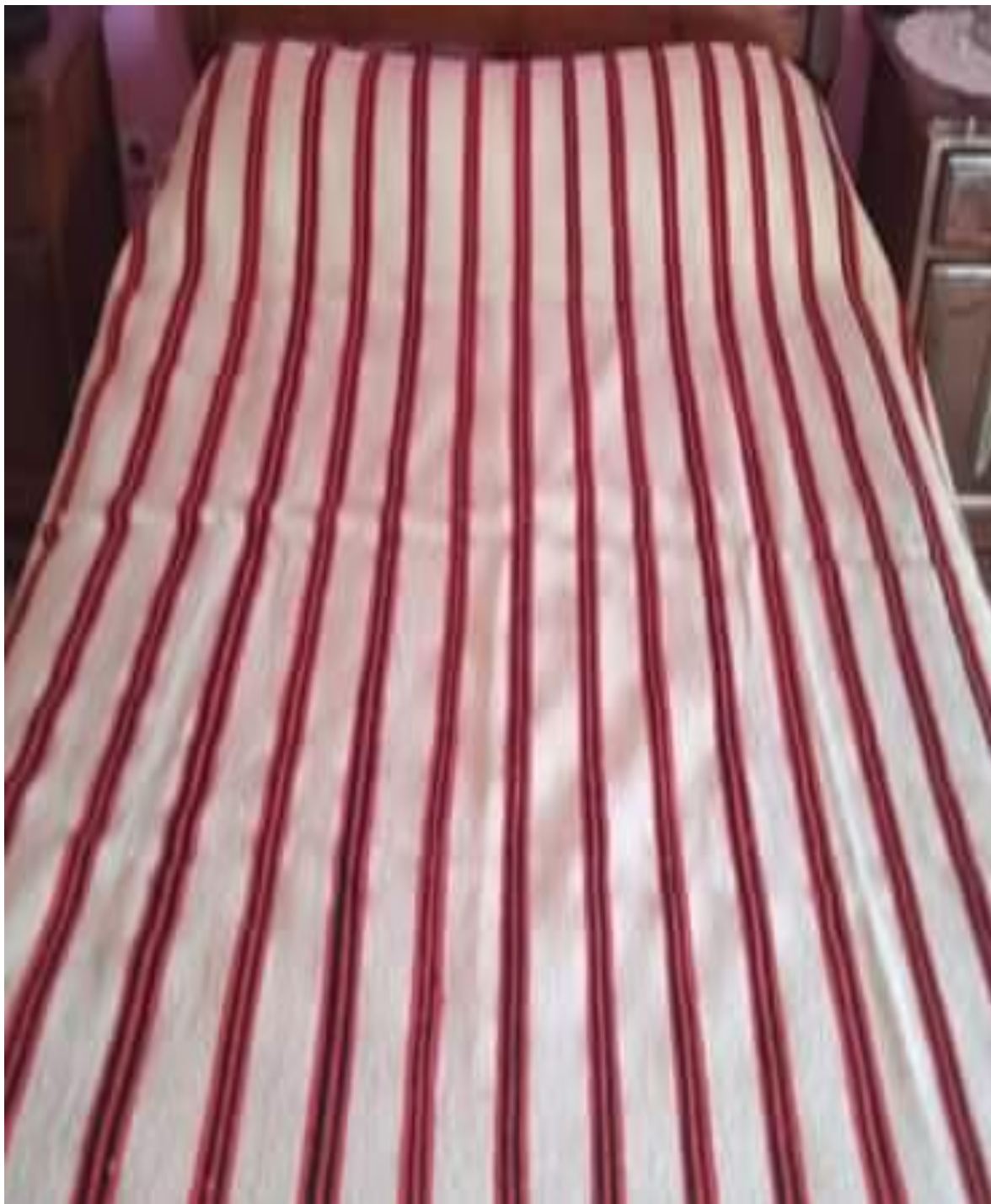
Tugna 46 «Taxellalt n yizarigen» 56