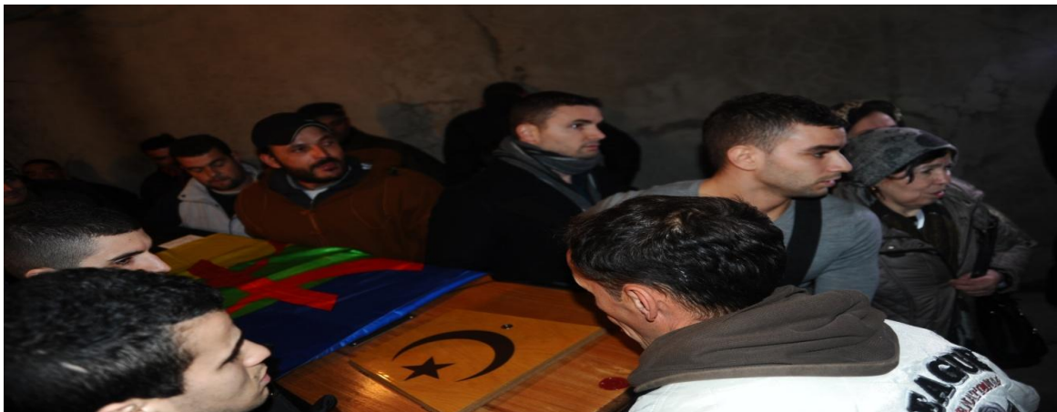
Tugna n tmeṭṭut-is akked ukuz n dderya-s: massinissa akked yugurten amnay yer tama n yemma-tsen. Kussayla Guda Waylis yer tama i iqublen yemma-tsen.