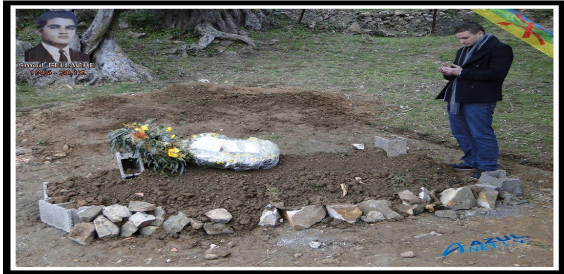
Tugna n mmi-s n Smaeil Bellac, Massinissa ass n temdelt-is