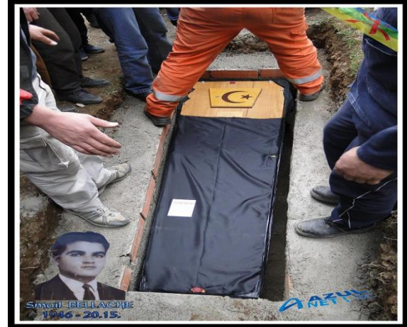
Tugniwin n wass n temdelt-is