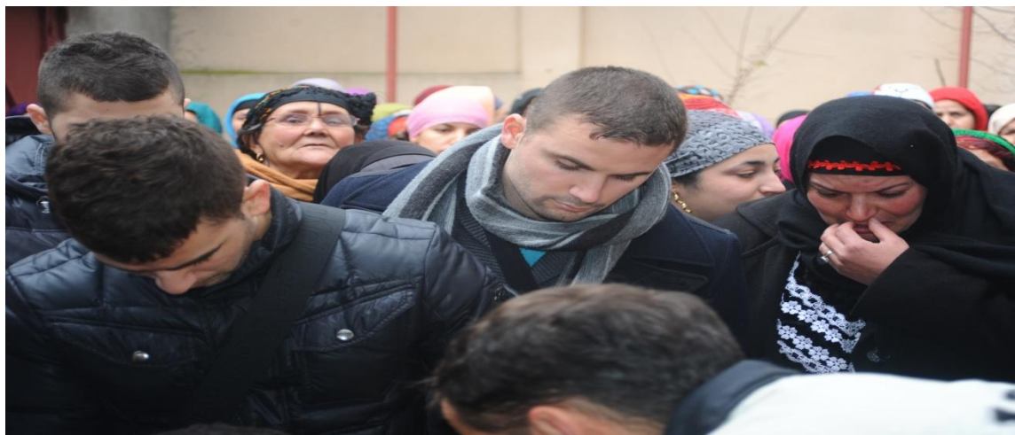
Tugna n tarwa-s: Massinissa yer tama tazelmađt akked Kahina