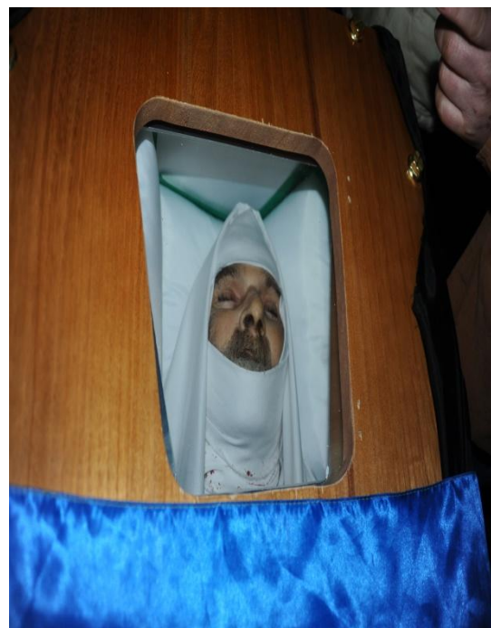
Tugna n Smaïl Bellač mi yemmut