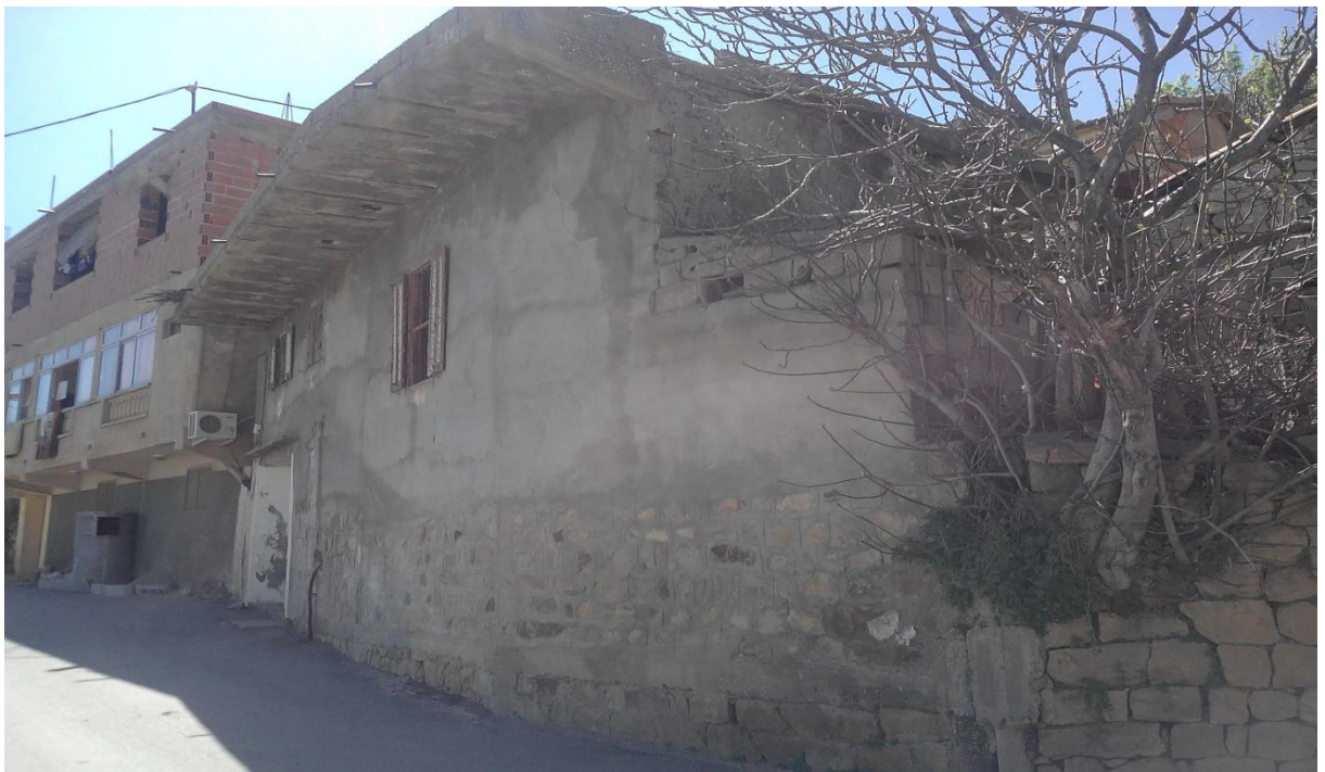
Tugna n uxxam anda yettwarebba Smaeil Bellac deg Luḍa, seg berra.