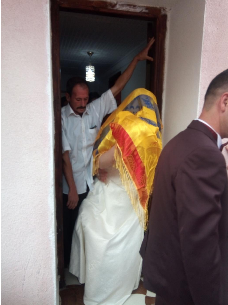
Tugna 9: Tislit mi ara teffey daw ufos n bab-as, ass 26/09/2020.