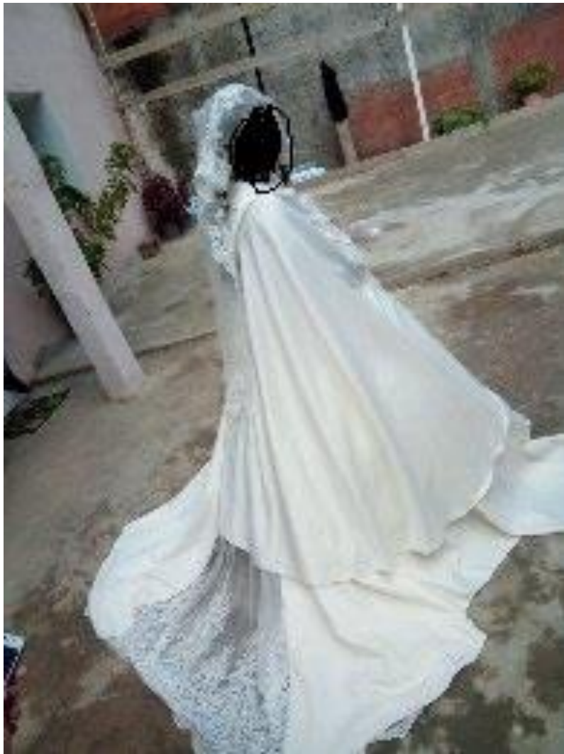
Tugna 7: Taqndurt tamellalt (la robe blanche) s wacu ara teddu teslit yer uxxam n urgaz-is i as-ten-id win deg leghaz, ass 26/09/2020.