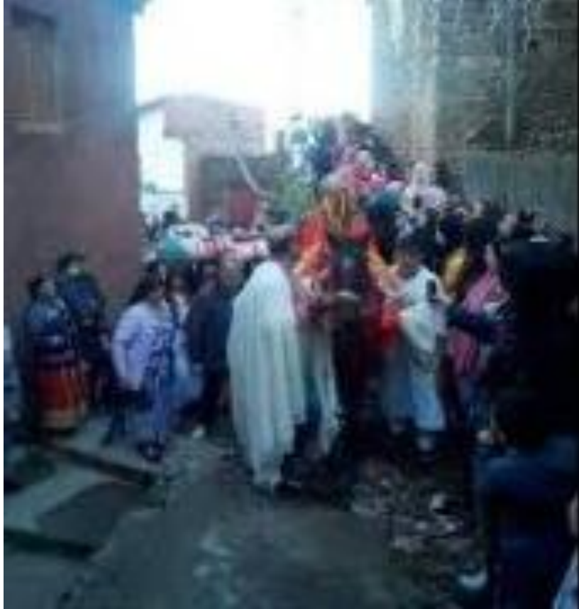
Tugna 2 : Amek tawin imawlan n yesli tislit yer uxxam-nsen yef uyyul, akk ula d tugna-ya xedmey-tt seg tugna.