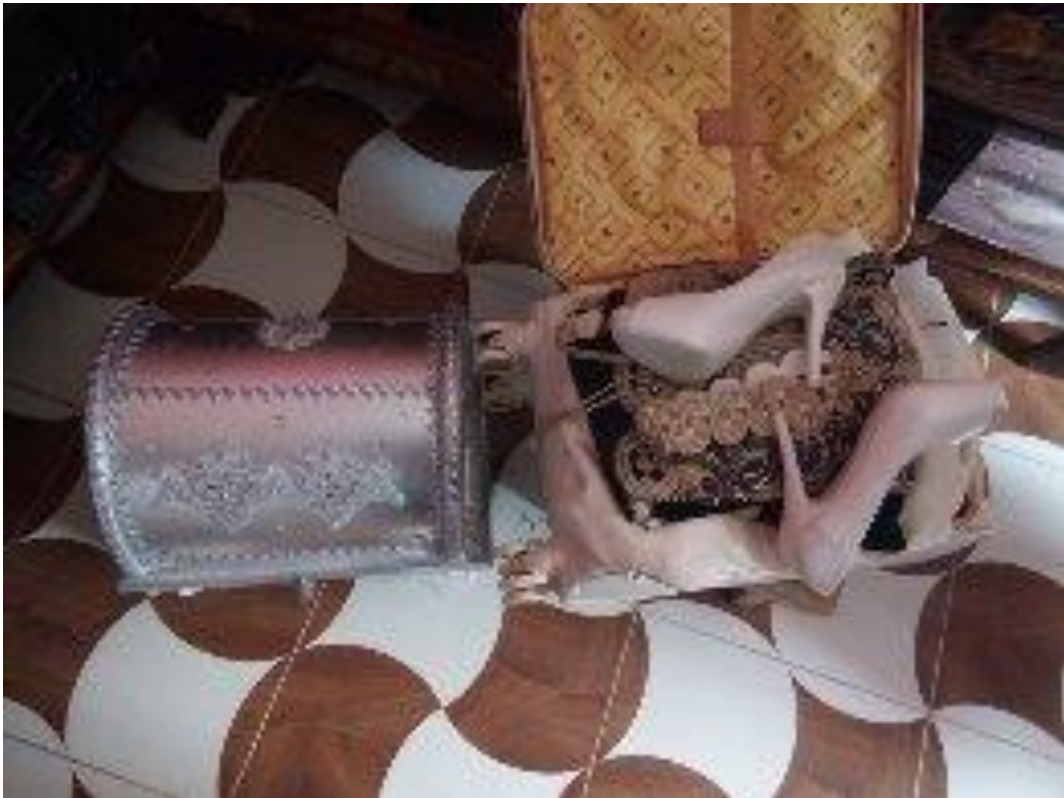
Tugna 6: Leġhaz d uqfu n leħenni i as-d-wwin i teslit ass n tmeyra-s deg yiḍ akken ad s-qnen leħenni yef 20h n yiḍ, ass 25/09/2020.