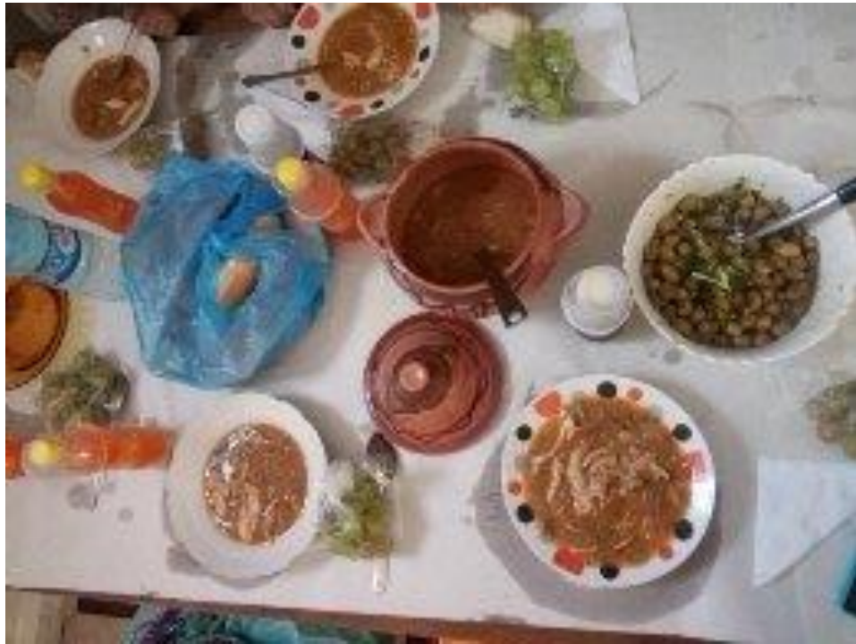
Tugna 5: Tagella ara ččen imawlan n teslit ass mi ara ruřen yer uxxam n yesli, anda ęęrey ass 26/09/2020.