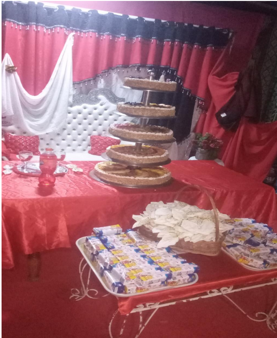
Tugna 12: (la pièce montée) d wadeg anda ara qqim yesli d teslit akken ad xedmen tixutam yef 23h, ass 26/09/2020.