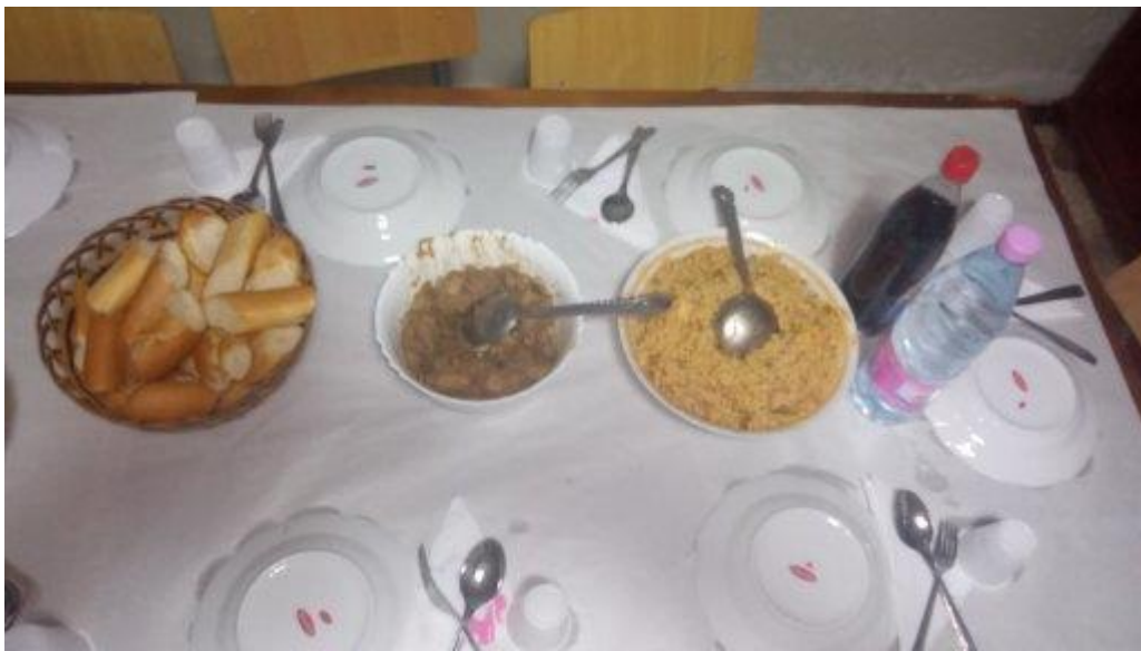
Tugna 4: Tagella ara ččen axxam n teslit d yimaerađen ass wis sin n tmeyra, anda ęęrey ass 25/09/2020.