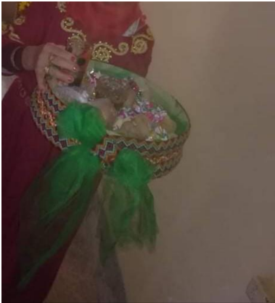
Tugna 11: Tayerbalt s wacu tt-laqa yemm-as n yisli tislit-is, ass 26/09/2020.