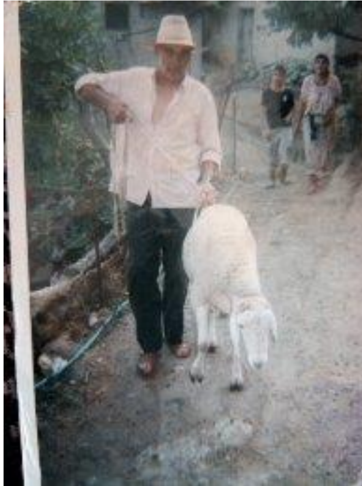
Tugna 1 : Imensi iqeffafen umi qqaren ikerra aqeffaf tawin-it yer uxxam n teslit, tugna-ya xedmey-tt seg tugna deg yiwen n uxxam mazal asean tugniwin n zik.