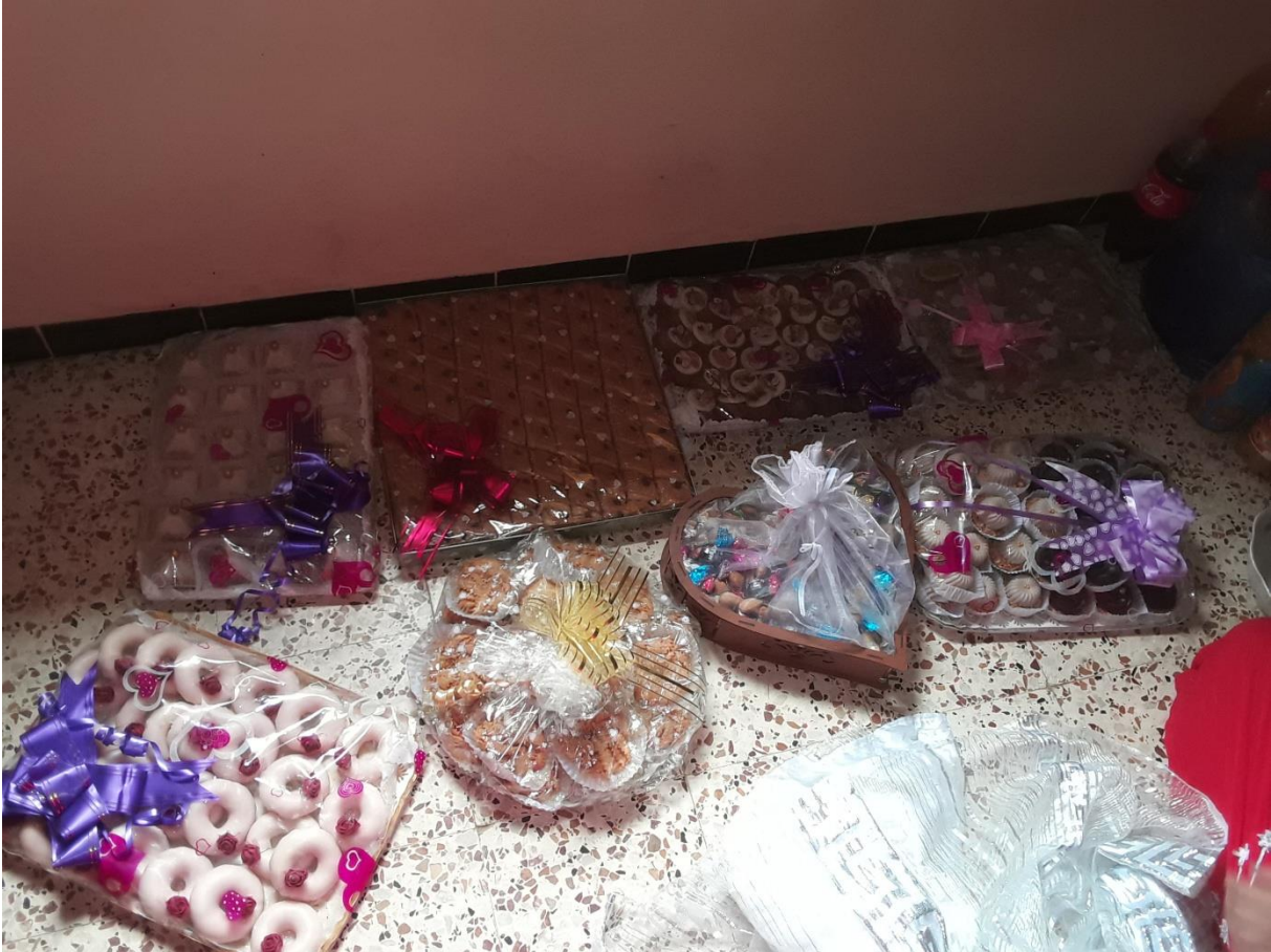
Tugna 8: Tizidanin i tettawi teslit yid-s mi ara tawin yer uxxam n urgaz-is, i wakken ad tefreq tmeyart-is i yinebgawen, ass 27/09/2020.