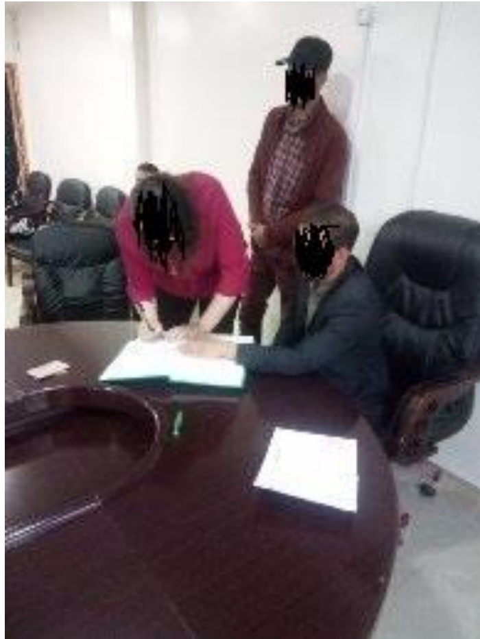
Tugna 3 : D tin id t-biyinen amek xeddmnen laeqed deg tyiwant, anida hedyey ass 10/09/2020.