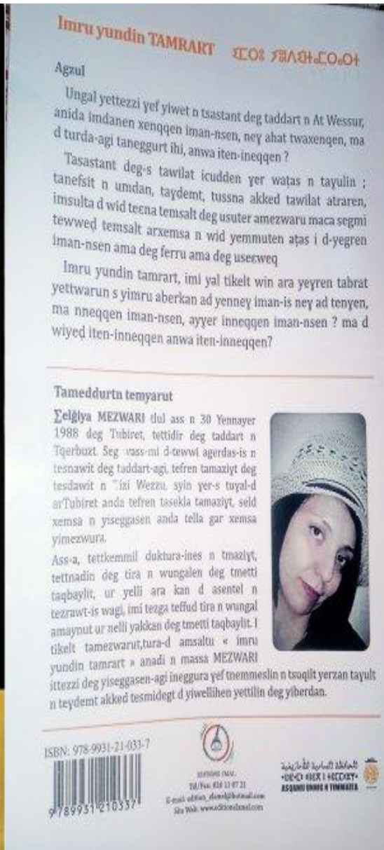
Tugna n wungal " Imru yundin TAMRART " n Aldjia Mezwaru